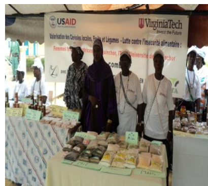
Women Transformatrices proudly posing with their diplomas and their products.

On October 10th, over 100 "Femmes Transformatrices" were recognized in a graduation ceremony for successfully completing a USAID/ERA sponsored training program. The ceremony marked the ending point of the workshops that were started in February at the Université de Ziguinchor (UDZ). After the ceremony, the women displayed many of their wares for sale in an exhibition hall. The program was designed in collaboration with UDZ and