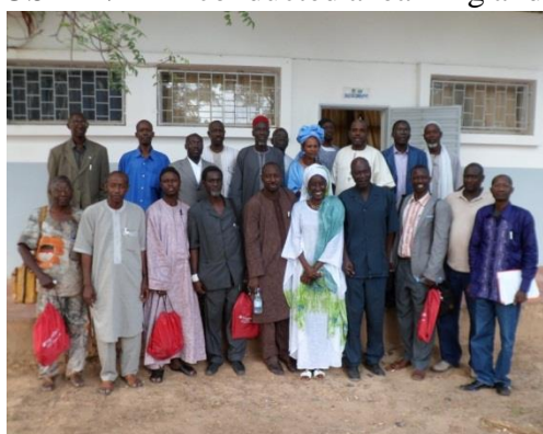
Participants gathered for a group photo at the “Experiential Learning” conference in Bambey

USAID/ERA conducted a learning and instruction workshop on November 29 th for 19 faculty