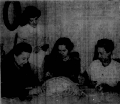
Sewing Studio, Arlington.