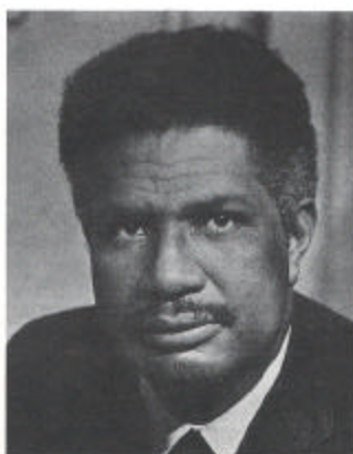
Ossie Davis Playwright-Actor-Director