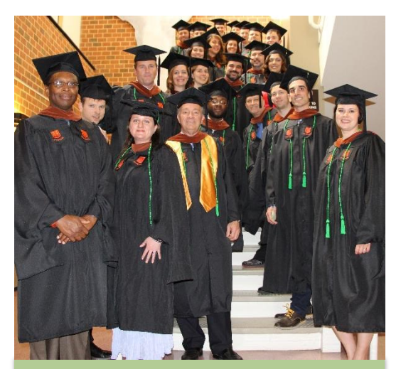
600 took Sustainability Graduation Pledge