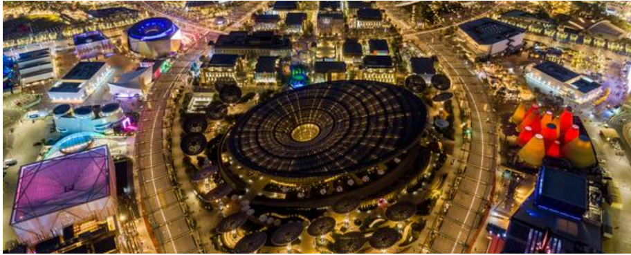
Aerial view of the Expo 2020 Dubai at night.

dogs, bathrooms with height adjustable benches and hoists, step-free access to every pavilion within the Expo, Hearing Induction Loops or Hearing Enhancement Systems to ensure individuals who use hearing aids would be able to enjoy audio within pavilions, Braille and tactile map boards, ear defenders and sunglasses, Quiet Rooms in Visitor Centers and sensory rating cards for every pavilion that displays the sensory impact of the pavilion based on the six senses for neurodivergent individuals or those with sensory processing difficulties.