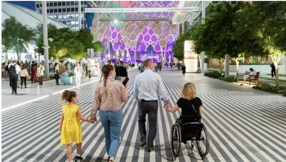
A family walks towards Al Wasl at the Expo 2020 Dubai.

FEATURES & ADVICE | LACEY PFALZ | DECEMBER 13, 2021