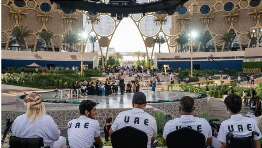
Visitors watch an event at Al Wasl during World Children's Day at the Expo 2020 Dubai.