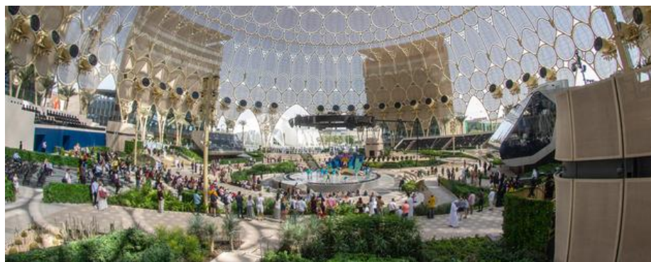
Interior of Al Wasl, one of the Expo 2020 Dubai's main pavilions.

have hosted Tolerance and Inclusivity Week in November. Our ultimate aim is to ensure this mega-event fulfills its purpose of bringing the world together to create a better future for all humanity," said Storey.