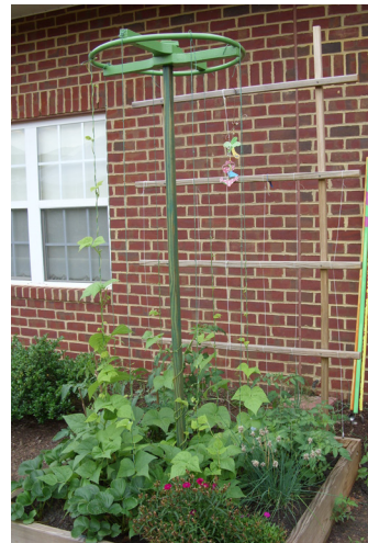
Figure 2. This low raised bed also includes a trellis.

Low Raised Beds. Low raised beds are usually 8-10 inches in height. These beds are used to grow deep rooted plants, or plants that will be very tall, for example, dwarf fruit trees. They may be combined with a trellis to add vertical gardening.