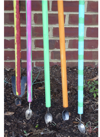
Figures 10 & 11. Modify existing tools to help gardening become more comfortable.