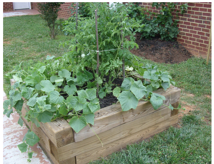
Figure 3. Deep raised beds provide a way to garden from a sitting position.

Deep Raised Beds. Deep raised beds can be built at a height and width that will provide easy access from a sitting position. They may have a border or edge wide enough for a person to sit upon.