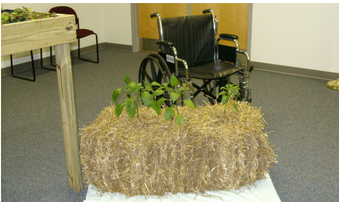
Figure 8. A straw bale garden.

Straw bales can be used for the garden, a seat in the garden, or both. With topsoil on top of the bale, you can start your garden with seeds or transplants. Holes can be cut into the bale and soil and plants added. The straw bale should be aged and heavily wetted before planting.