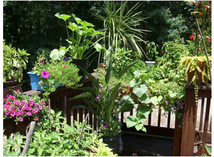
Figure 5. Container gardening provides much versatility.

containers will need to be watered frequently. Even full-sized bush-type vegetables can grow in containers of at least 18 inches diameter.