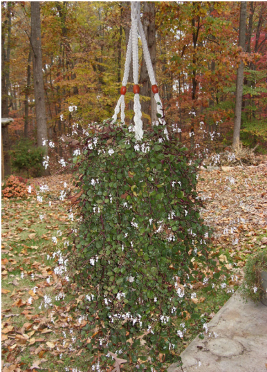
Figure 7. Hanging baskets provide another alternative to traditional gardening.

Hanging baskets are not much different from any other container in their cultural requirements. However, their small size may require more frequent watering. A pulley system on the basket may make it easier for those in wheelchairs to reach. Compact vegetable varieties can be grown in a hanging basket, bushel basket, or pot.