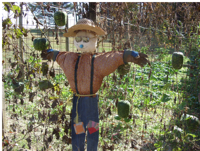
Figure 9. This scarecrow displays how to dress for gardening.

A lightweight, light colored, long sleeved shirt will protect the arms. Gloves not only help reduce scratches and prevent blisters, they provide protection from bacteria and fungus that live in the soil and may provide protection from snakes, spiders or rodents living in your garden, as well as poison ivy and insect bites. One drawback of using gloves is for the blind gardener who relies on the sense of touch for much information.