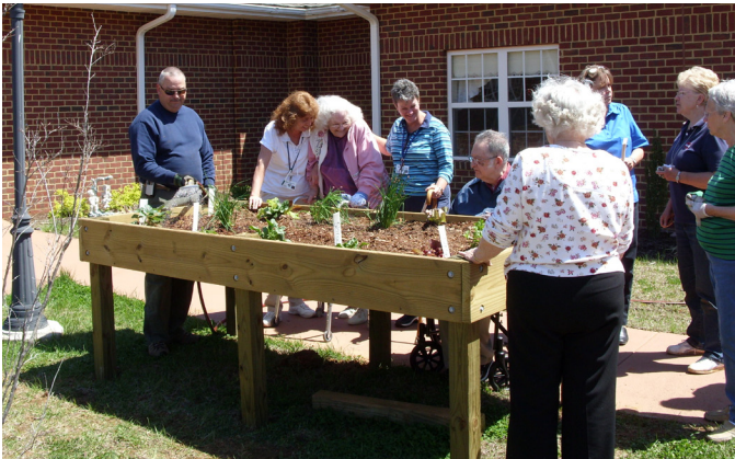
Figure 4. Elevated beds are usually thirty inches off the ground.

Elevated Beds. Elevated beds are shallow beds that are raised off the ground upon legs. These beds are especially good for the chair-bound individual. The height from ground level to the bottom of the bed should be as low as is comfortable for the individual. Thirty inches is usually satisfactory for an adult. If the bottom of the bed is much higher, the soil level will be so high as to cause excessive fatigue of the arms while working. However, this bed can be constructed higher for those who prefer to stand. The elevated bed should be at least eight inches deep and is usually made of wood. The plantings within the bed should be shallow-rooted annual vegetables and flowers.