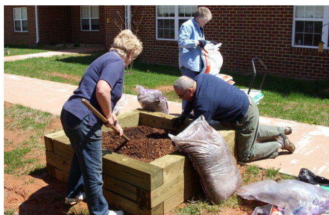
Figure 1. Extension Master Gardeners construct a deep raised bed. Gardening can be modified through this and other techniques to allow those with physical challenges to participate.

Using horticulture for healing has a long history. In early Egypt, physicians and philosophers recognized the healing benefits of gardening (Woy, 1997, p. x). In the United