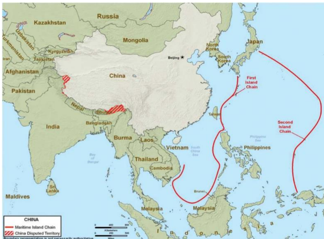
Figure 4-1 – First and Second Island Chain

In order to build up its forces, the Chinese have delineated geographic boundaries. These layers of regions help the Chinese phase the development of their navy. The regions are known as the First Island chain and the Second Island chain. Figure 4-1 illustrates the territorial delineation of the island chains 314 .