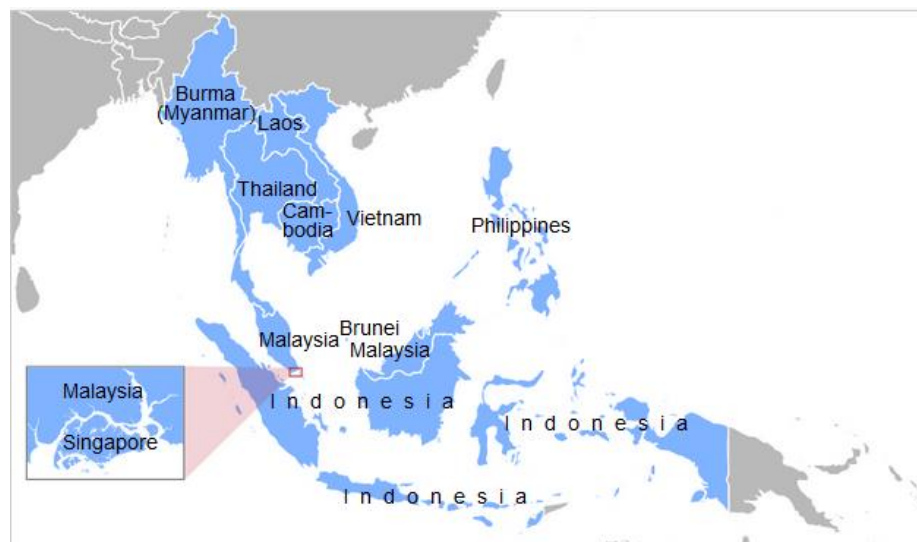
Figure 3-6 – ASEAN Member Nations

for economic growth and union. As a result, ASEAN began to focus on regional trade and security issues. In July of 1995, the regional calculus changed. The former nemesis, Vietnam not only established diplomatic relations with the US but became a member of ASEAN 232 . Shortly after, Laos and Burma joined the organization. Figure 3-5 depicts the member nations of ASEAN. With the inclusion of the entire region, the focus of the organization shifted to economic growth but also resolving outstanding territorial issues. Most of the members began to see a common denominator as a threat to the region, China. Even though China had not been a formal ally, ASEAN and China were united in their stance towards the Soviet Union and Vietnam during the Cold War. But with the Cold War divisions gone and China's rise, ASEAN had its eyes on a new antagonist.