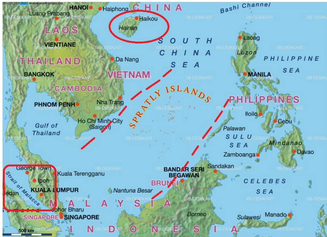
Figure 3-5 – Spratly Islands 167

the mainland and offshore islands of China. The archipelagos occupy a position central to the shipping lanes connecting Canton, Hong Kong, Manila and Singapore. Hence, it has geographic significance for military and economic considerations 166 .