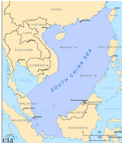
Figure 3-1: South China Sea 132

Kaplan mentioned that the “The Western Pacific will return military affairs to the narrow realm of defense experts” and it will become the new battleground for the world’s existing superpower and emerging power 133 . WWII was a battle for supremacy against fascism, the Cold War against communism, and the War on Terror against extremism, but the new global rivalry between the US and China will be less about ideological difference more about pure military supremacy in the Western Pacific 134 . Robert Kaplan referred to the South China Sea as the “the 21 st century’s defining battleground” and the “throat of global sea routes 135 . China has continuously affirmed “indisputable sovereignty” over the entire sea and has evolved its naval philosophy accordingly. This strategy includes building up naval forces that can project outside their traditional grounds near the coast to further distances. The rise of the People’s Liberation Army Navy (PLAN) is what has provoked the US to “pivot” towards Asia. The clashes over dominion in the sea is more