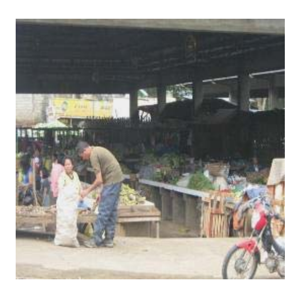
procure from farmer-producers are resold to wholesale or retail buyers and

By their own account, these six women biyahidors have demonstrated individual grit and group strength as micro vegetable entrepreneurs. For several decades now, they have established themselves in one section of Loverslane, a marketplace in adjoining Valencia City, where the vegetable goods they