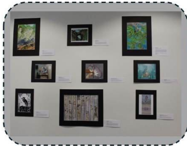
2024 GS(art)S Gallery Wall

GSRS 2026 is excited to continue GS(art)S, a geoscience-themed art exhibition featuring handmade pieces by graduate and undergraduate students, on display both days of the symposium.