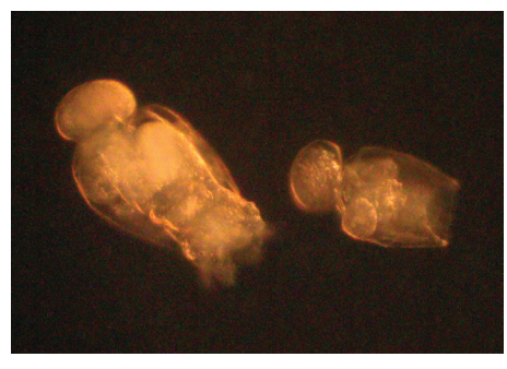
Figure 1: Rotifers

Live feeds are an integral component in the cultivation of most marine finfish species during larval stages. The first live feed that has demonstrated acceptability for most marine species, and which can typically be raised on a commercial scale, is the rotifer Brachionous spp. While approximately 2200 thousand species of rotifers have been identified, most culturists