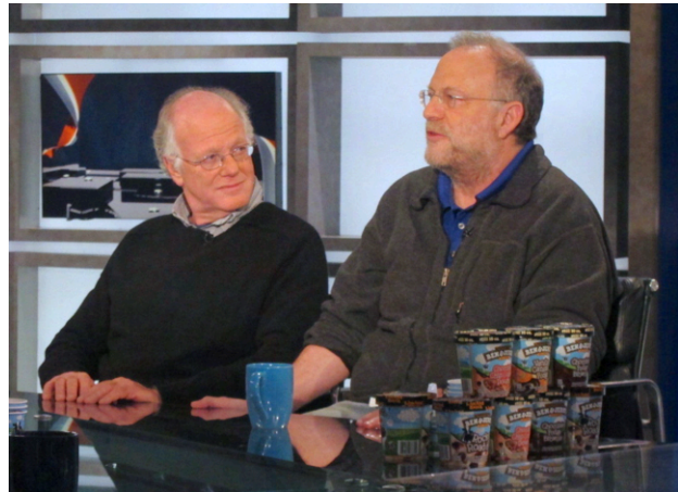
Figure 6.1: Ben Cohen and Jerry Greenfield.

In the meantime, Jerry Greenfield (the “Jerry” of Ben & Jerry’s) was following a similar path. He majored in pre-med at Oberlin College in the hopes of one day becoming a doctor. But he had to give up on this goal when he was not accepted into medical school. On a positive note, though, his college education steered him into a more lucrative field: the world of ice cream making. He got his first peek at the ice cream industry when he worked as a scooper in the student cafeteria at Oberlin. So, 14 years after they first met on the junior high school track team, Ben and Jerry reunited and decided to go into ice cream making big time. They moved to Burlington, Vermont—a college town in need of an ice cream parlor—and completed a $5