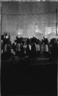
The Milkmaids Drill: