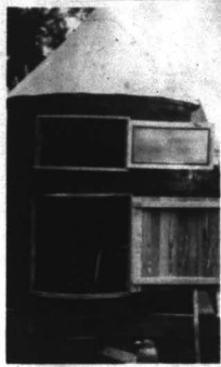
This comfortable broader house shows the ingenuity of Landon Carter, Boylston 4-H club member. He took an old water tank and by spending a few dollars on it converted it into a practical broader house.

The following picture shows what another did: