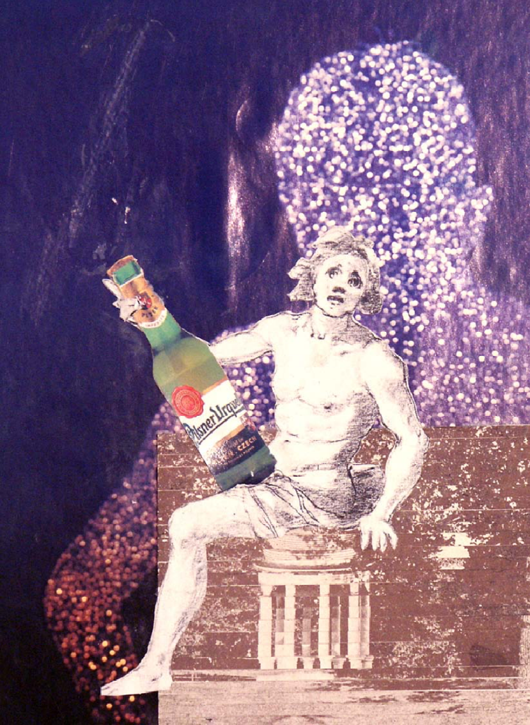
Meditation III (Beer)

Architecture is an exhaustive act. With the Herculean efforts of the patron, the architect and the builder, a building comes into being. Materials are collected and transformed in order to create a place for Man to dwell. That is, materials occurring in their natural state are transformed by the Hand of Man and thereby enter into His realm. In turn, the Manmade becomes situated in and a part of the natural world. This relationship is a material reciprocity . In the Timaeus, a concept of a world soul is outlined in which all elements that compose the physical world (the “ten-thousand things” of the Tao-Te Ching) are endowed with consciousness: the Anima Mundi.