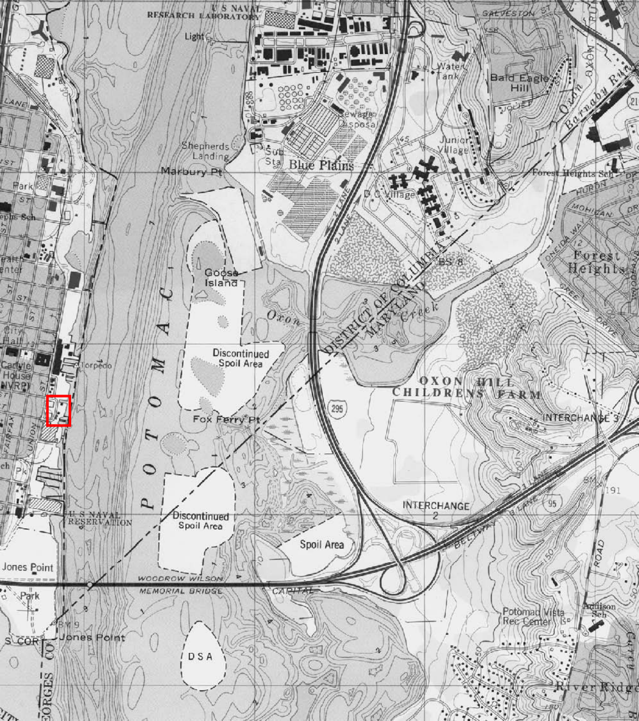
The Strand, Alexandria, Virginia