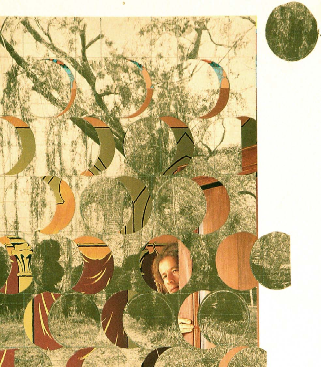
Meditation I (Cosmos)

The drunken consciousness is one bit of the mystic consciousness, and our total opinion of it must find its place in our opinion of that larger whole.