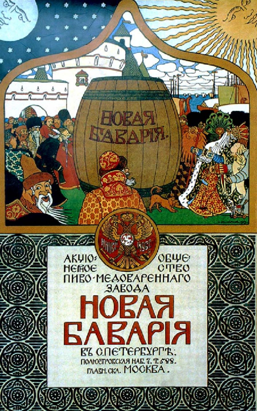
New Bavaria Mead and Beer