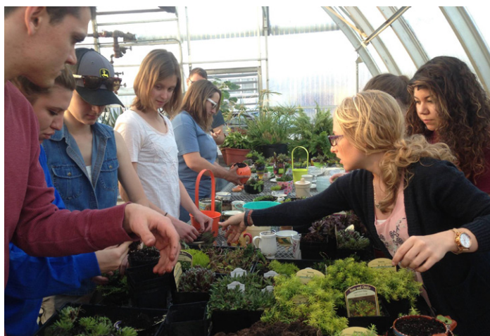
Horticulture Club preparing succulent plantings for the annual plant sale!

Get ready for the Horticulture Club Plant Sale, April 21-23rd! The students in ornamental plant production and marketing are doing a great job with their crops up in the greenhouse. Join the VT Horticulture Club Plant Sale facebook page to see more photos and get updates.