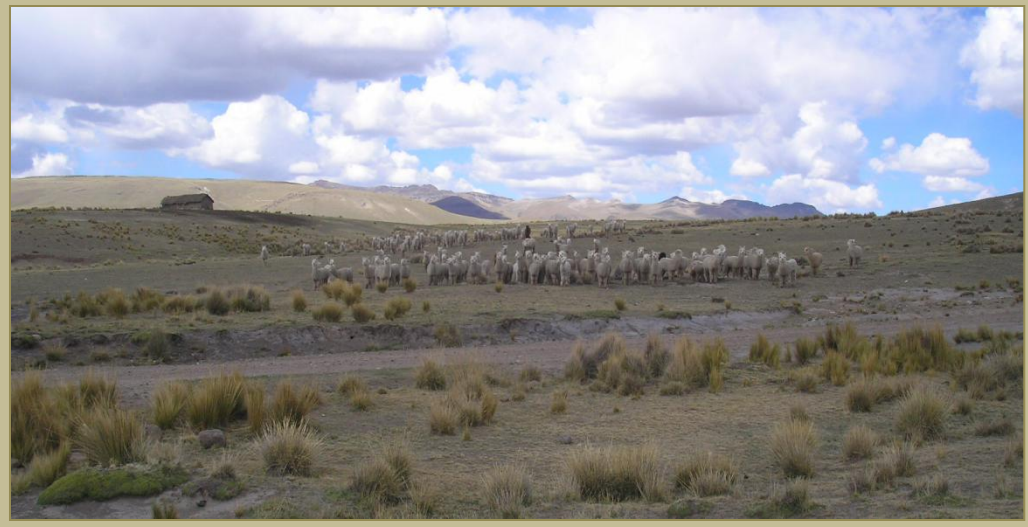
Dry puna zone, Community of Apopata