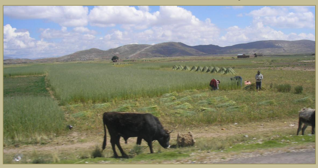
Lakeside zone, Community of Santa Maria