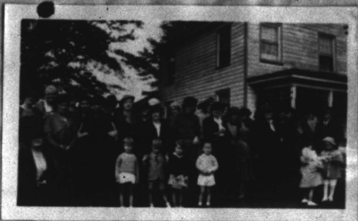
Part of the Home Demonstration group on Project Tour