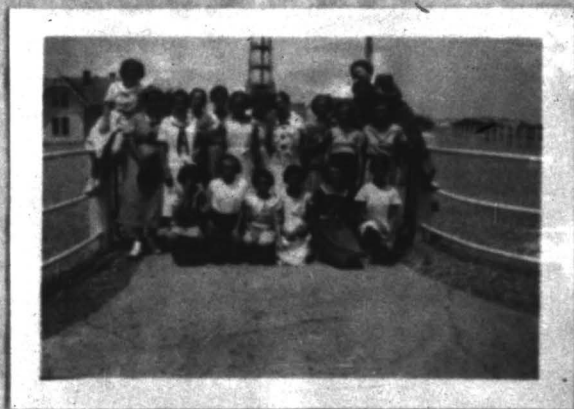
Norfolk County 4-H members at Cape Henry Camp