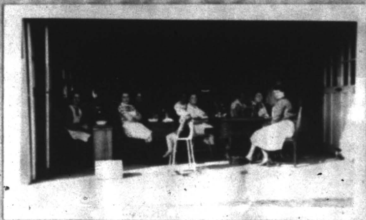
One of the four machine schools held during February