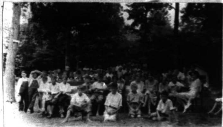
Part of the group the last day of camp.