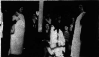
The 2nd. Leader's Conf. where the Guide Pattern was being fitted.

One hundred thirty cotton and silk dresses have been made by the women. A review of dresses made by Guide Pattern was an interesting part of the County Achievement Program. Eighteen entries were made in the Borden Fabric, National Contest. Two, ten dollar prizes were won. One member, who made Guide Pattern, has completed twenty dresses for herself, and others, and won three prizes, amounting to $26.00 on dresses that cost her $2.50