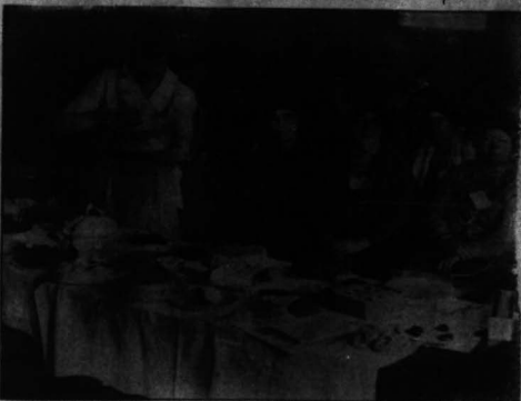
—City Photo. Members of the Home Demonstration clubs of Goodland, Heards, Chesterfield and Probsthor counties attended a "market institute" held here yesterday under the auspices of the V. F. I. Extension Service.