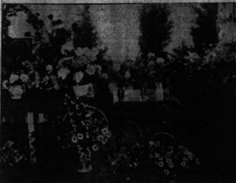
Some of the flowers displayed in the Chesterfield County flower show held yesterday in the Centralia community building are shown above.