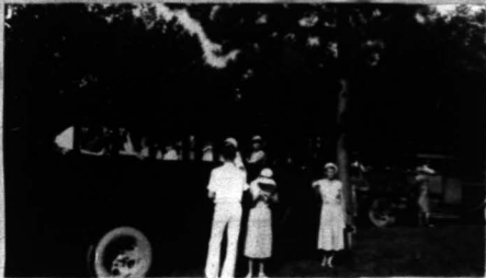
Ready to return home after a happy and profitable week.

The camp closed on Friday night with a water melon feast, and game nite indoors. Camps always mean renewed interest and enthusiasm.