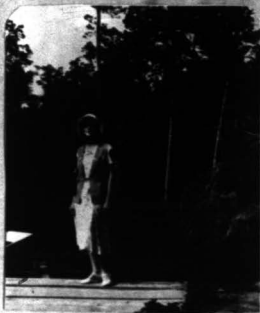
FIRST PRIZE DRESS.