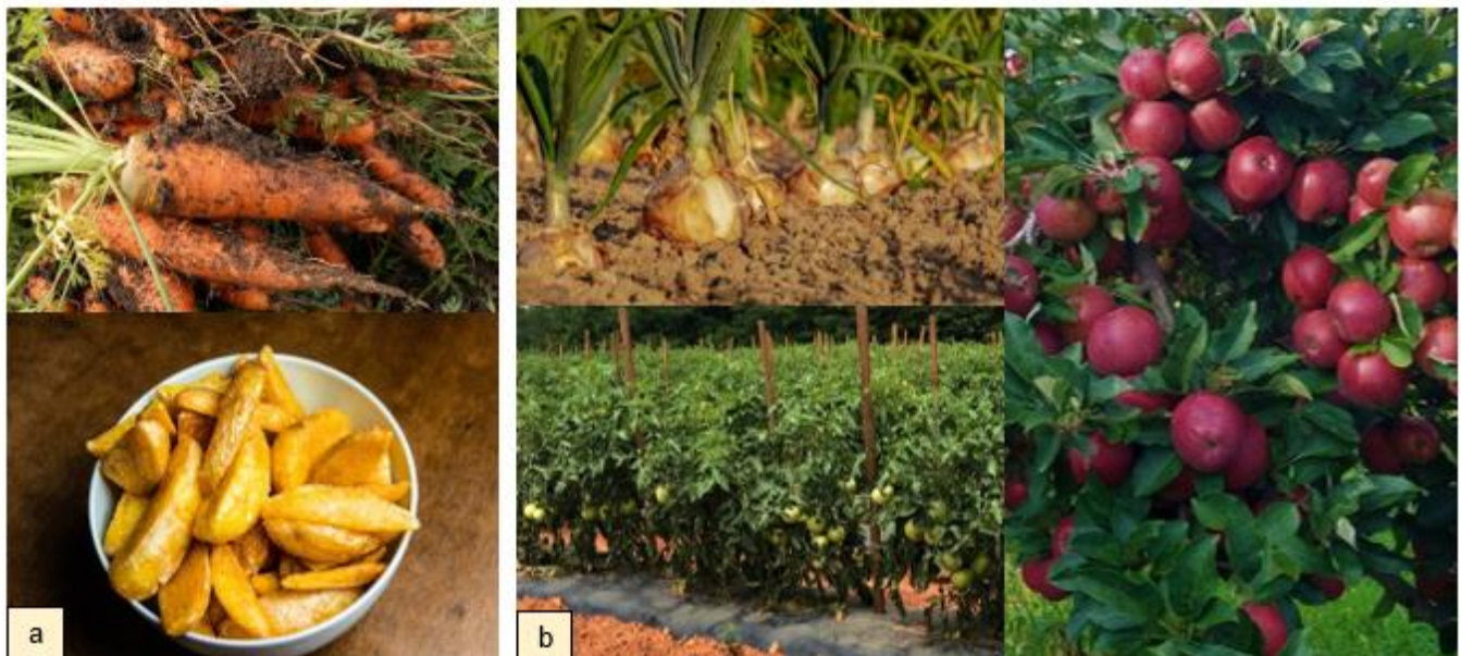
Figure 3. (a) Both carrots and potatoes are grown underground; however, carrots may be eaten either raw or cooked whereas potatoes are typically cooked. (b) Onions, tomatoes, and apples are eaten as both raw and cooked; however, onions come into direct contact with the soil, whereas tomatoes and apples are aboveground. In all cases, it is a good idea to consider the potential risks for each crop at pre-plant, production, harvest, and post-harvest stages.

An important consideration at the pre-plant stage also includes plant morphology and anatomy, or the external and internal characteristics of the crop plant. It can be especially important to identify the parts of the plant that will be harvested for food when evaluating risks (Figure 3). Is the harvested portion above ground or below ground? If it is below ground, is the food typically eaten raw or cooked (e.g., carrots versus potatoes)? If the harvested portion is above ground, does it grow on the ground directly (e.g., summer squash, winter squash, onions), or is it aboveground (e.g., staked tomatoes, apple trees)? Are each of these types of produce eaten raw or are they cooked? You should also consider the susceptibility of the fruit or vegetable for infiltration of microorganisms. There is research to support internalization of human pathogens through the roots, stomata, or blossoms. You should also determine if the crop surface poses any additional risks. For example, some cantaloupe has a netted rind, which may promote attachment of microorganisms. It may be helpful to reach out to your local extension agent or specialist to discuss your crops and the latest research on those crops in regards to food safety.