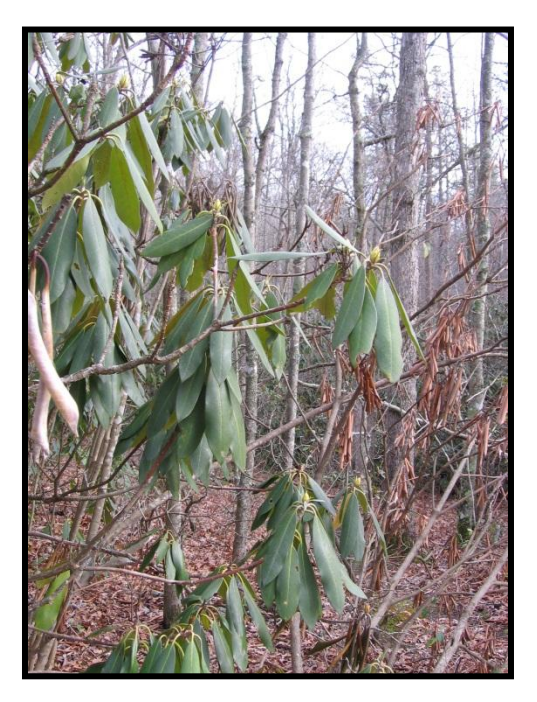
Figure 2. Rhododendron leaves wilting under dry conditions.

As it does in other organisms, water in tree cells provides a solvent that contains and transports the many substances needed for biochemical reactions. Water is itself involved in many of these reactions, particularly in photosynthesis, the process whereby green plants convert light energy into carbon-based chemical energy (or food). When plants absorb carbon through leaves for photosynthesis, they also lose water at the same time. This tradeoff between carbon and water drives the plant's circulatory system and cools plant leaves through vaporization, where heat energy is released to the environment. Water in trees and other plants is also needed to maintain pressure in cells that supports