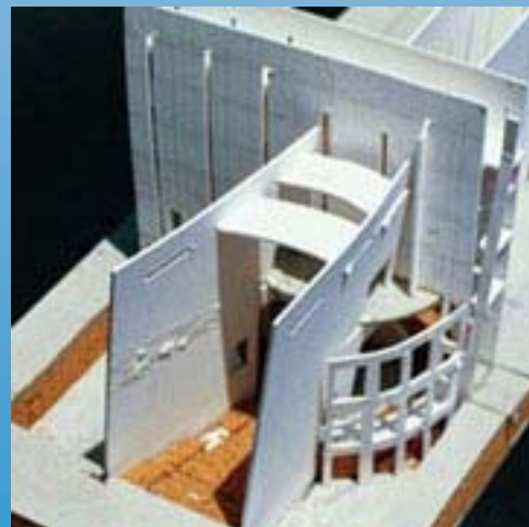
Process Model: View of Sacred Wing at South of site