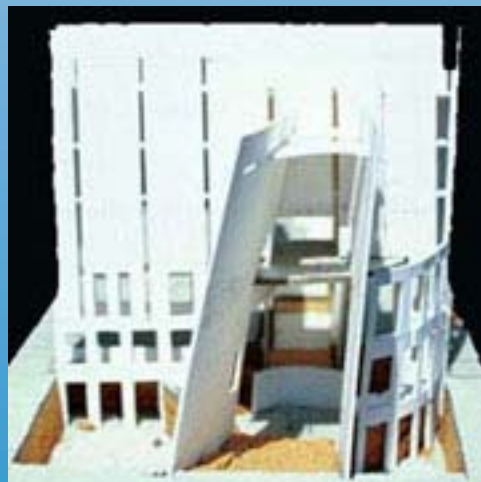
Process Model: View of Meditation Chapel

The Research Wing is slightly smaller than the Residence Wing although it shares similar design characteristics. Each office suite has a group gathering or waiting space offering views of the city. Each suite has a separate entrance directly off the Library Hall. Treatment rooms within the Research Wing are designed to make the residents feel as if they are in a private doctor's office and not in a hospital room. Antiseptic white walls are replaced with calm, soothing pastel colors. Rather than drab flat white ceilings, the treatment rooms have coffered dropped ceilings. Carpeting covers the floors of the Research Wing. Laminated natural cork covers the floor of the treatment rooms. The carpeting and cork flooring gives the rooms a warm and inviting feeling, yet remains easy to clean.