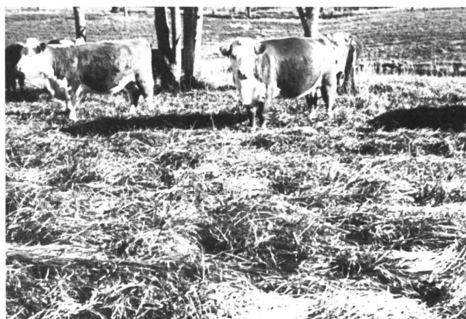
Figure 5. Cows Utilizing Stockpiled Tall Fescue for Winter Grazing.

Tall fescue pastures to be stockpiled should be grazed down to about 2 inches by mid-August and topdressed with