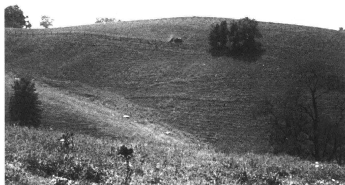
Figure 2. Liming and Fertilizing Steep Pasture.

Some steep areas have soils capable of high pasture production but are inaccessible to conventional equipment. However, many areas within steep boundaries can be reached with conventional applicators (Figure 2). Such areas should be treated first, since they are often the most productive soils.