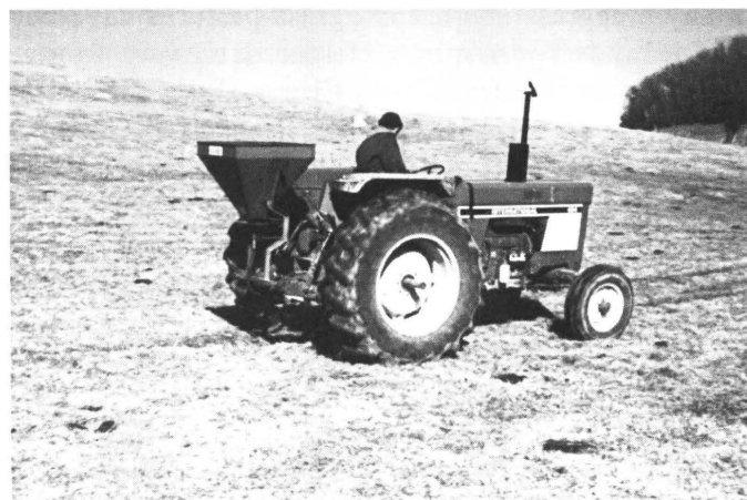
Figure 3. Broadcasting Clover Seed in Late Winter.

If a satisfactory stand of grass is present, make the same preparations as when drilling a grass-clover mixture, then broadcast clover and/or lespedeza seed on the sod surface