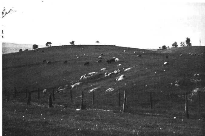
Figure 1. Cattle and Sheep Grazing on Typical Steep Pasture in Virginia.

Virginia has about 1.5 million acres of steep pastures (Figure 1). Simply turning livestock onto these pastures to graze requires little management. However, managing these pastures so that they provide year-round grazing in the quantity and of the quality needed requires sound planning, excellent judgment, and an understanding of how to handle the plant-animal relationship so both will benefit.