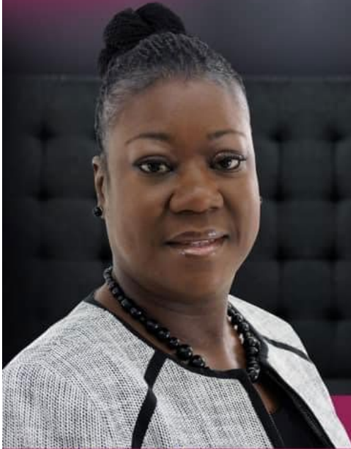
Sybrina Fulton JANUARY 25TH (12-1PM ET)