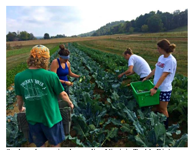
Students harvesting broccoli at Virginia Tech's Dining Services acreage at Kentland farm.

Through a research study conducted through Harvard's Food Law and Policy Clinic, the contributors highlight the importance of how universities and colleges should be capitalizing on the increasing demand of buying and eating local. They recommend that state colleges and universities gain a "competitive edge" by being more transparent with their food procurement practices. This in turn could raise the colleges' and universities' public ranking and would therefore give themselves a competitive edge in student recruitment. Collaborations, in which institutions grow a part of their produce at campus facilities, not only provide a fresh source of local foods for the dining hall, but also