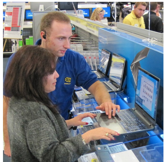
Figure 13.9: Personal selling at Best Buy

Many retail stores depend on the expertise and enthusiasm of their salespeople to persuade customers to buy. Home Depot has grown into a home-goods giant in large part because it fosters one-on-one interactions between salespeople and customers. The real difference between Home Depot and everyone else isn't the merchandise; it's the friendly, easy-to-understand advice that sales people give to novice homeowners,