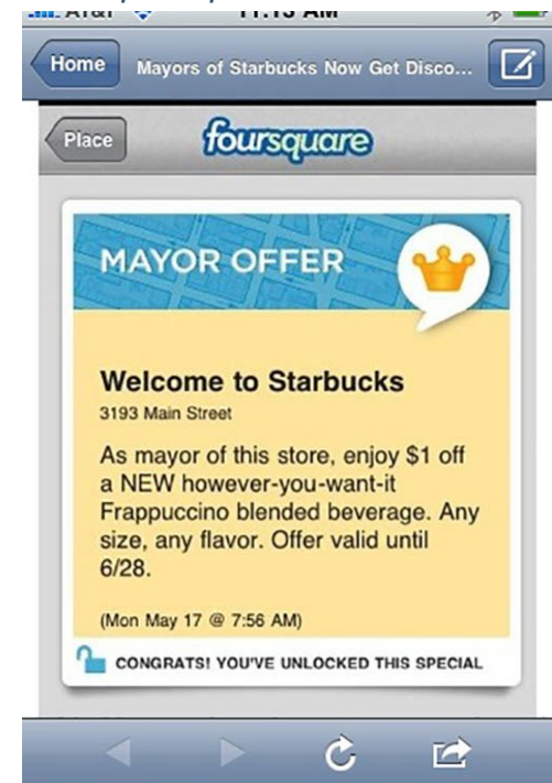
Figure 13.15: Starbucks and Foursquare promotion.

This promotion was a joint effort of Foursquare and Starbucks. Foursquare is a mobile social network, and in addition to the handy "friend finder" feature, you can use it to find new and interesting places around your neighborhood to do whatever you and your friends like to do. It even rewards you for doing business with sponsor companies, such as Starbucks. The individual with the most "check in's" at a particular Starbucks holds the title of mayor. For a period of time, the mayor of each store got $1 off a Frappuccino. Those who used Foursquare were