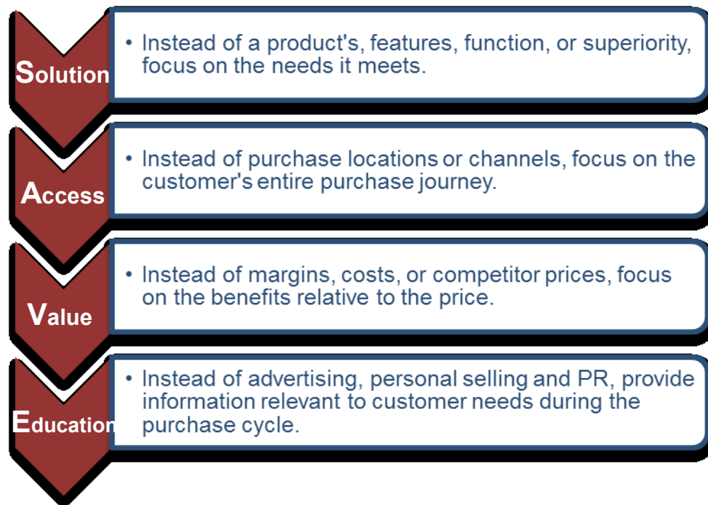
Figure 13.16: The SAVE framework

advocate replacing the 4P's with SAVE as companies define their offerings. The essence of