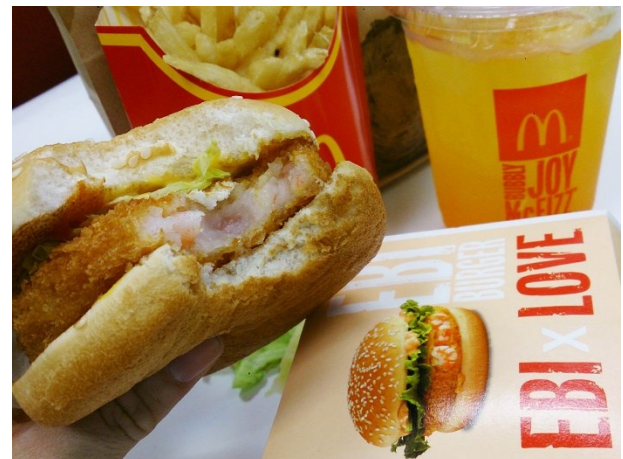
Figure 13.3: A McDonald's Ebi (prawn) burger meal in Singapore

Geographic segmentation —dividing a market according to such variables as climate, region, and population density (urban, suburban, small-town, or rural)—is also quite common. Climate is crucial for many products: try selling snow shovels in Hawaii or above-ground pools in Alaska. Consumer tastes also vary by region. That's why McDonald's caters to regional preferences, offering a breakfast of Spam and rice in Hawaii, 8 tacos in Arizona, and lobster rolls in Massachusetts. 9 Outside the United States,