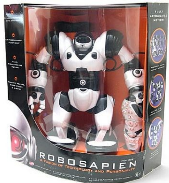
Figure 13.6: Robosapien in its package

How has Wow Wee handled the packaging and labeling of Robosapien? The robot is