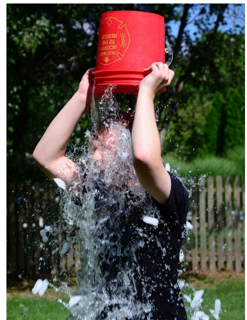
Figure 13.13: The ALS Ice Bucket Challenge in action

To get an idea of the power of social media marketing, think of the ALS Ice Bucket Challenge. According to the ALS Association: “the ALS Ice Bucket Challenge started in the summer of 2014 and became the world’s largest global social media phenomenon. More than 17 million people uploaded their challenge videos to Facebook; these videos were watched by 440 million people a total of 10 billion times.” 32 The ALS Association raised $115 million in six weeks (their usual annual budget was only $20 million). 33 To see how companies try to harness this power, let’s look at social media campaigns of two leaders in this field: PepsiCo (Mountain Dew) and Starbucks.