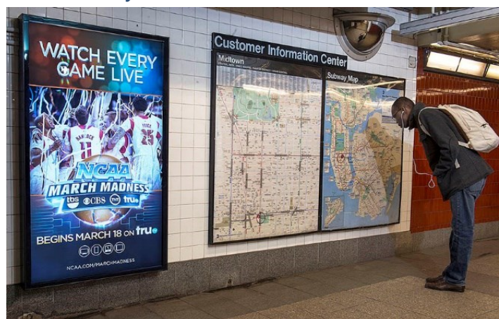
Figure 13.8: A digital advertising screen in the New York subway.

We'll now examine each of the elements that can go into the promotion mix—advertising, personal selling, sales promotion, and publicity. Then we'll see how Wow Wee incorporated them into a promotion mix to create a demand for Robosapien.