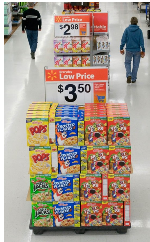
Figure 13.10: Sales promotion at Wal-Mart

It's likely that at some point, you have purchased an item with a coupon or because it was advertised as a buy-one-get-one special. If so, you have responded to a sales promotion – one of the many ways that sellers provide incentives for customers to buy. Sales promotion activities include not only those mentioned above but also other forms of discounting, sampling, trade shows, in-store displays, and even sweepstakes. Some promotional activities are targeted directly to consumers and are designed to motivate them to purchase now. You've probably heard advertisers make statements like "limited time only" or "while supplies last". If so, you've encountered a sales promotion directed at consumers. Other forms of sales promotion are directed at dealers and intermediaries. Trade shows are one example of a dealer-focused promotion. Mammoth centers such as McCormick Place in Chicago host enormous events in which manufacturers can display their new products to retailers and other interested parties. At food shows, for example, potential buyers can sample products that manufacturers hope to launch to the market. Feedback from prospective buyers can even result in changes to new product formulations or decisions not to launch.