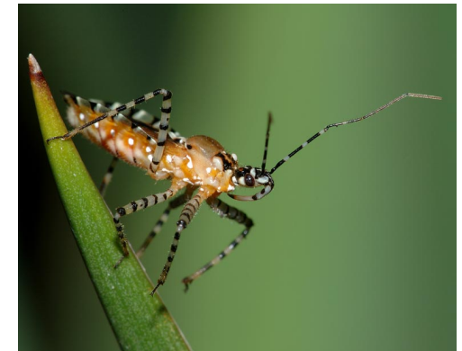
Assassin bug nymph