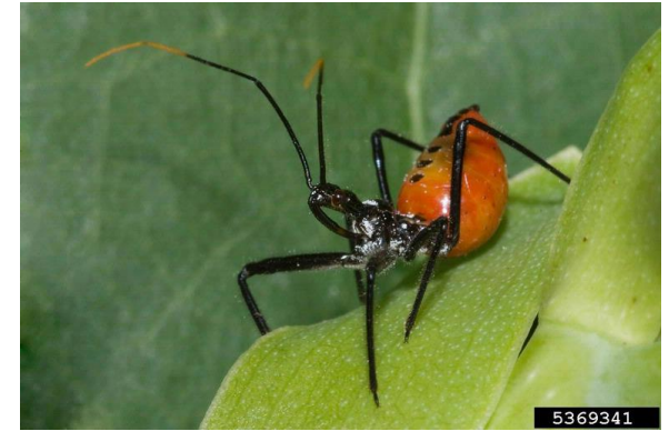
Wheel bug nymph