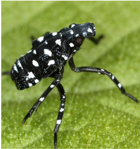
Young spotted lanternfly nymph Berks Co. Conservation Dist.

Immature spotted lanternfly, Lycorma delicatula (White), are black with white spots when young. They turn red and black with white spots when older. A few other insects in Virginia have similar color patterns, but a close look will show that immature spotted lanternflies are easily recognizable. Sizes not to scale.