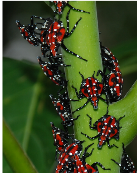
Older spotted lanternfly nymphs Eric Day, Virginia Tech