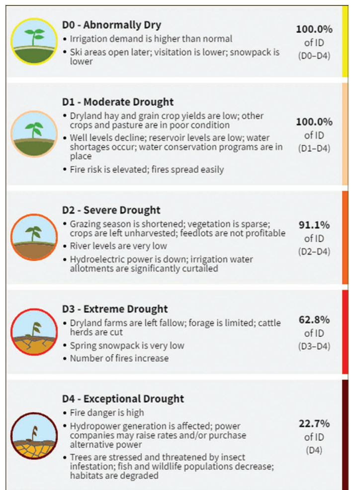
Figure 2. Idaho state-specific drought impacts compiled by the National Drought Mitigation Center, Sept. 10, 2021.

The drought specialists are estimating that the impacts on agricultural crops, rangeland, surface and groundwater, freshwater ecosystems, and wildfire risk are likely to continue and/