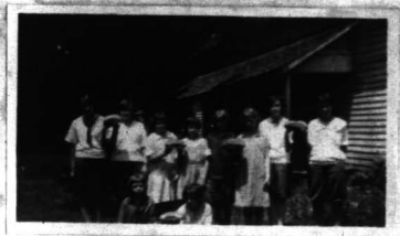
Bread & butter girls in camp