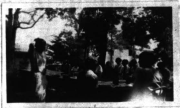
Learning to serve a meal properly