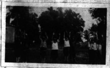
Getting an appetite for breakfast