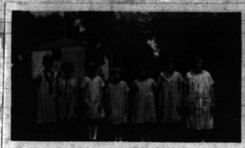
Cluttering Club Girls in Dresses made in club