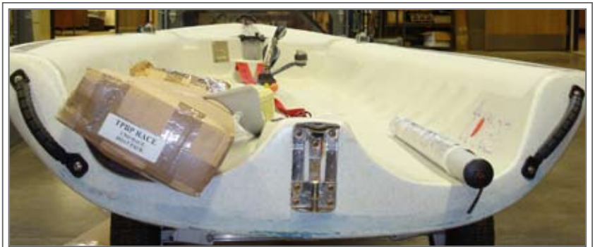
View from the stern of the Topaz Sailing System with accessories.

This project should be very interesting and engaging for the students, while showcasing the all encompassing nature of packaging. Topaz Sailing Systems was referred to the Center for Unit Load Design by Ongweoweh, a center member pallet company, who recommended the center’s expertise in total transport packaging design. In exchange for the service of the students and the Center for Unit Load Design in developing a transport solution, Topper Industries will be donating a new Topaz sailboat to the IOPP chapter to use as a fundraiser. Be on the lookout for information on how you could be the owner of this new boat!