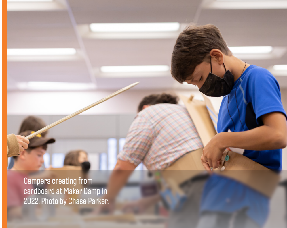
Campers creating from cardboard at Maker Camp in 2022.