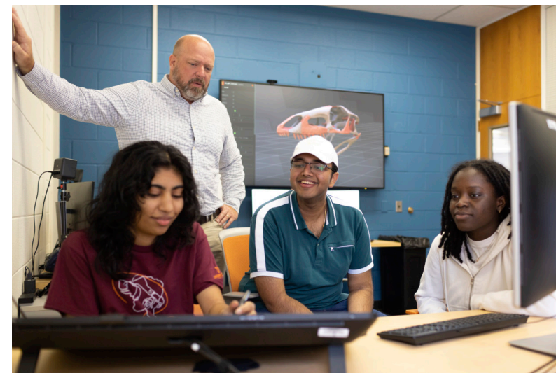
Members of ARIES work to create a virtual sculpture of the Teleocrater rhadinus.