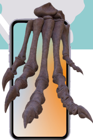
3D model of Teleocrater rhadinus foot