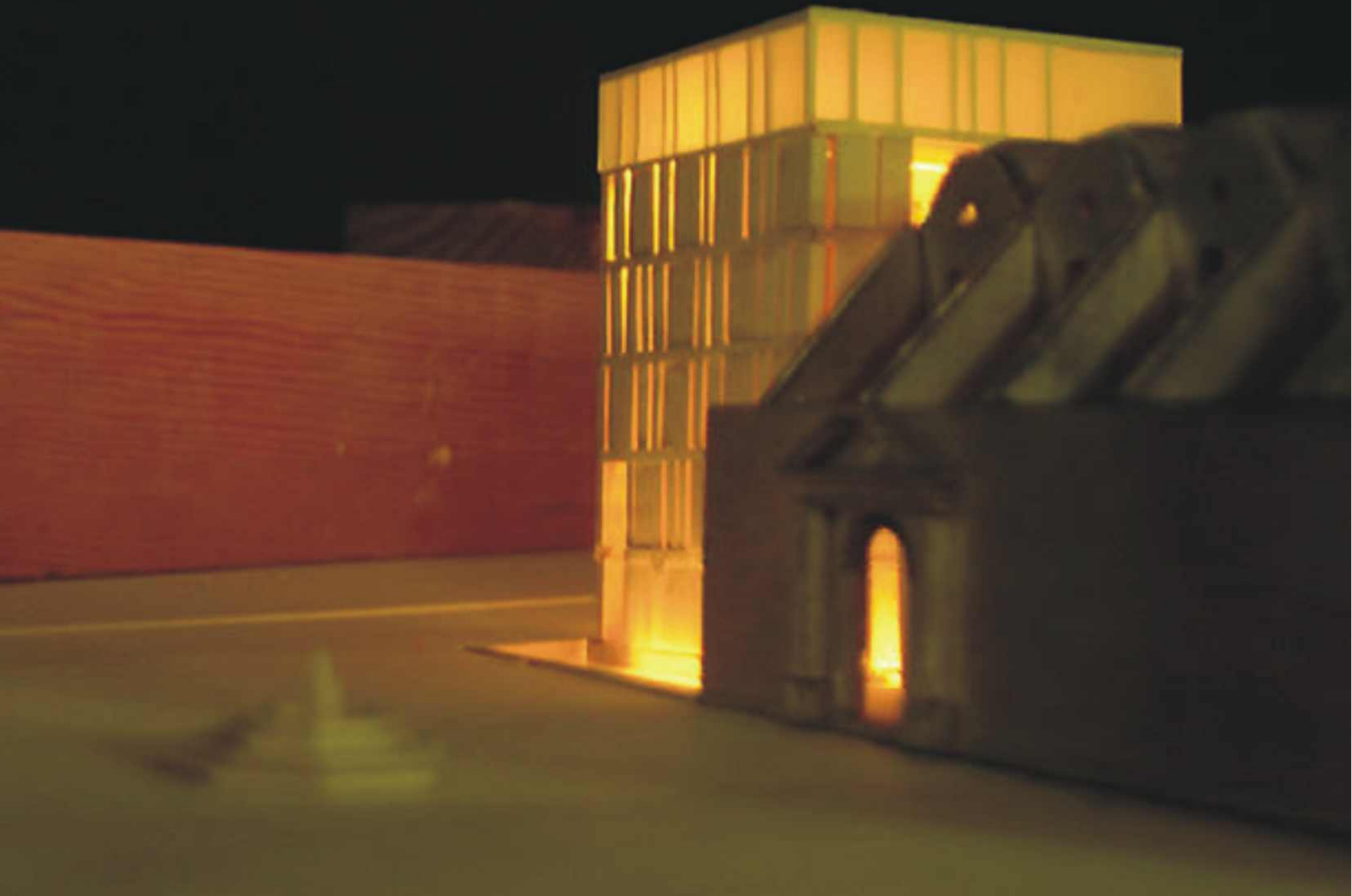
Fig. 14 View from plaza