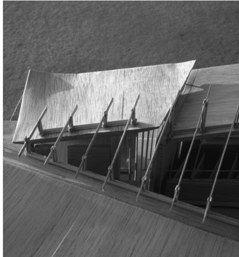
The atrium with stairways, walkways and long benches.