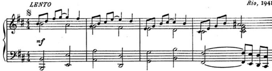
Example 1 Heitor Villa-Lobos, Bachianas brasileiras no. 4 (1941), 'Prelúdio (Introdução)', bb. 1–4.