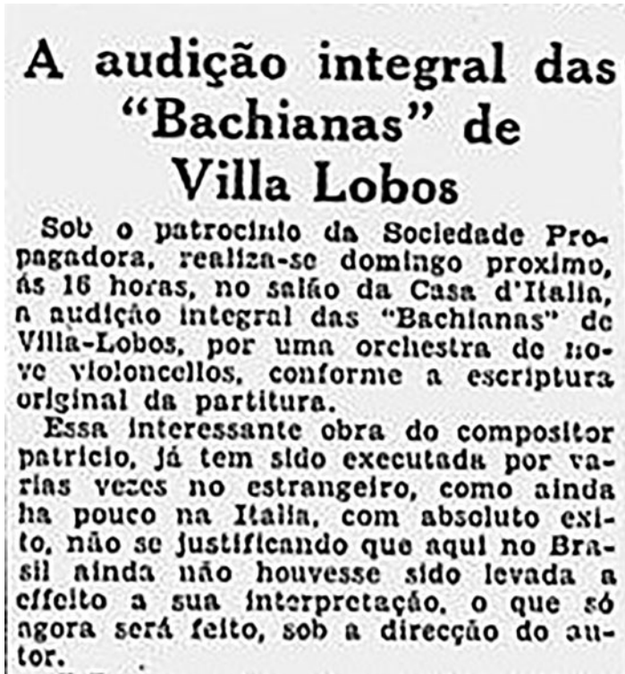
Figure 4 Announcement of the first integral performance of the Bachianas brasileiras (No. 1). Diário de Notícias , 10 November 1938. Hemeroteca Digital Brasileira, Fundação Biblioteca Nacional – BNDigital.

If the third movement was primarily a folk song rearranged, the first movement portrays Villa-Lobos using a theme inspired by Bach. In the ‘Prelúdio (Introdução)’, he uses an ascending arpeggio that seems to stem directly from the ‘Ricercar a 6’ that opens Bach’s Musikalisches Opfer , BWV 1079 (Examples 1 and 2).