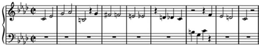
Example 2 Johann Sebastian Bach, Musical Offering , BWV 1979 (1747), 'Ricercar a 6', bb. 1–9 (adapted).

performance of the complete version of the Bachianas brasileiras no. 1, Mário de Andrade questioned the ambiguity of Villa-Lobos's claim that Bach was related to Brazilian folk music: