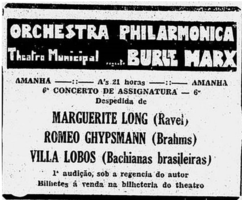
Figure 3 Announcement of the first performance of the first version of the Bachianas brasileiras (No. 1), Diário de Notícias , 11 September 1932, 12.

One of the differences between the first and the fourth Bachianas brasileiras is that the music Villa-Lobos uses had no apparent connection to Bach. The third movement quotes almost literally ‘Itabayana’, an unpublished song performed during his lecture in Prague. 80 The song, which in Prague was described as a ‘melody from Northern Brazil’ of ‘indigenous influence’, becomes, with minor adaptations, the A section of the ‘Ária (Cantiga)’. 81 The added B section where the first motif is played faster and in staccato has no explicit reference to Bach. Although the origins of the melody and the text are unclear – perhaps the attribution of an indigenous origin was another labelling strategy employed by Villa-Lobos in Prague – the removal of the lyrics and the transformation of the title from ‘Itabayana’ (which probably refers to the region where the song was collected) to an unmarked ‘aria’ suggests the deterritorialization of the song and is part of this process of cannibalization employed by Villa-Lobos. The year 1935 that appears as the composition date in its first publication in 1941 accuses the permanence of the original material for the song, while being imprecise about the date of adaptation to the new version.