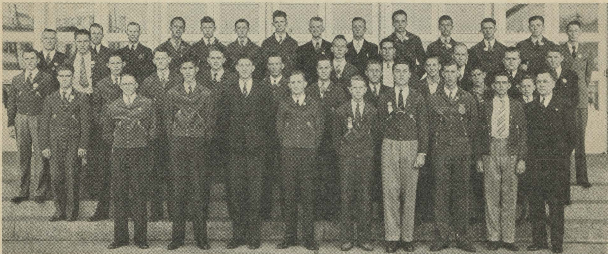
VIRGINIA DELEGATION TO THE TWELFTH ANNUAL CONVENTION OF FUTURE FARMERS.