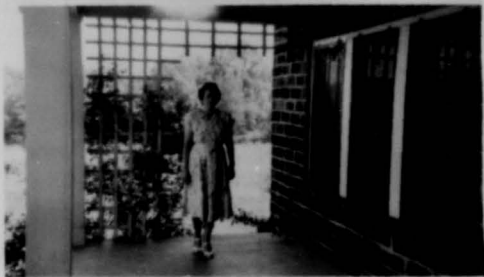
MODELING A FINISHED PRODUCT