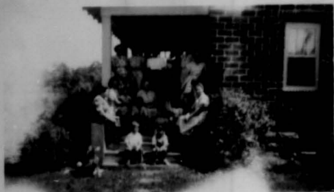
MEMBERS WITH CHILDREN