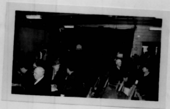
ANNUAL POULTRY - FLOCK OWNERS MEETING AT GRASSY KNOLL HATCHERY.