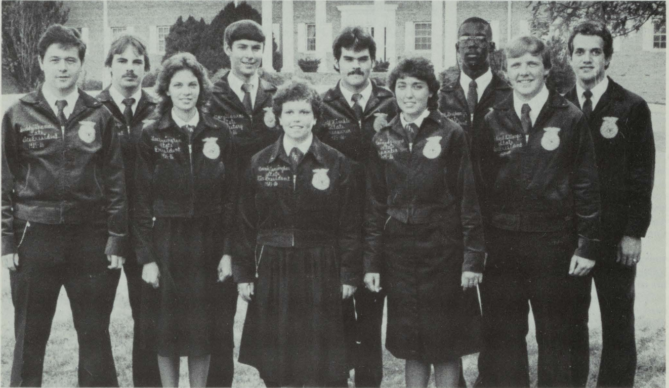
The 1985-86 State FFA Officers are preparing to conduct the 60th state convention June 17-20 at Virginia Tech.