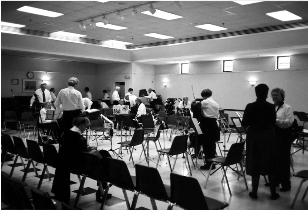
Figure 8. Musicians of the Second Wind Band prepare for their holiday concert.