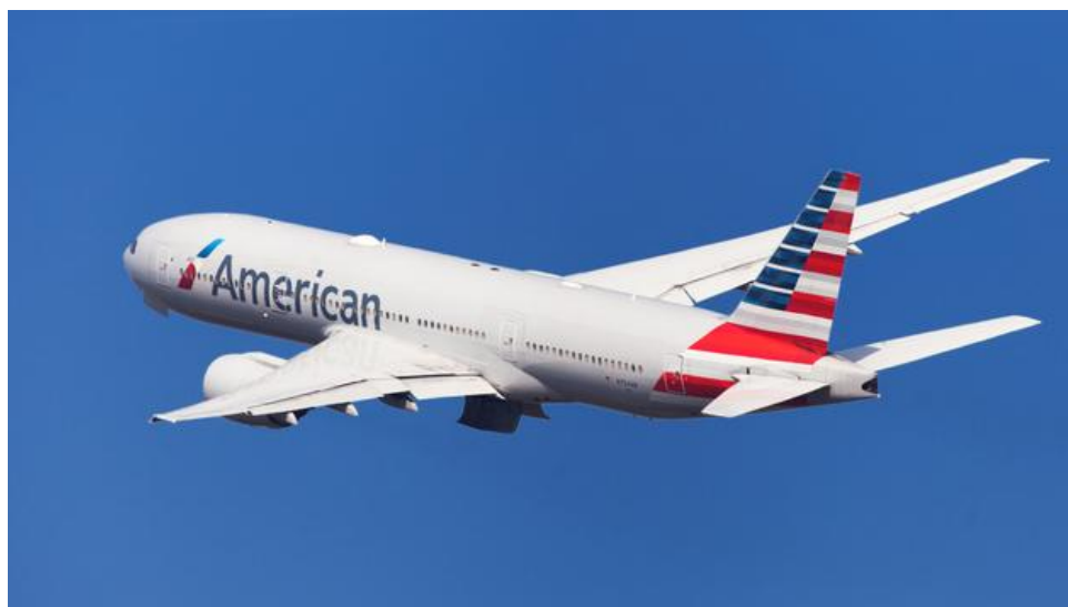
American Airlines Boeing 777-200ER.

American Airlines has partnered with Affirm, allowing customers to now pay for their flights in installments.