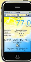
This is a snapshot from our final application, aptly named LumenWæther