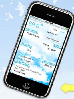
The results of our first iteration of interface design, the model with which we conducted our user study