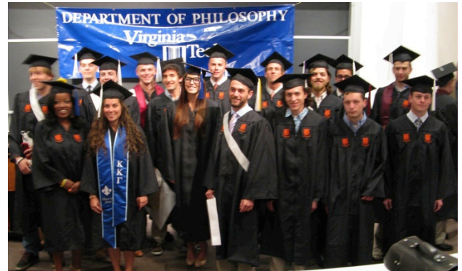
2014 Bachelor of Arts graduates