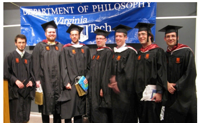
2014 Master of Arts graduates