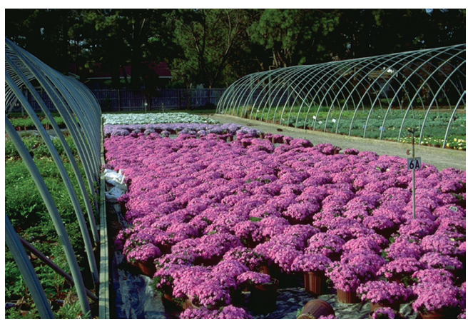
Figure 1. Greenhouse and nursery production of herbaceous perennials encompass hundreds of different crops. Growth management needs vary widely with species and cultivar.

Availability of chemical plant growth regulators for perennials is not a problem. All of the primary floriculture growth retardants are labeled for use on perennials. The issues are (1) lack of knowledge about rates, and (2) the wide disparity of plant responses to these PGRs. Even after years of research, many of the herbaceous perennials in the market have never been evaluated for their response to any of these chemicals (figure 1).