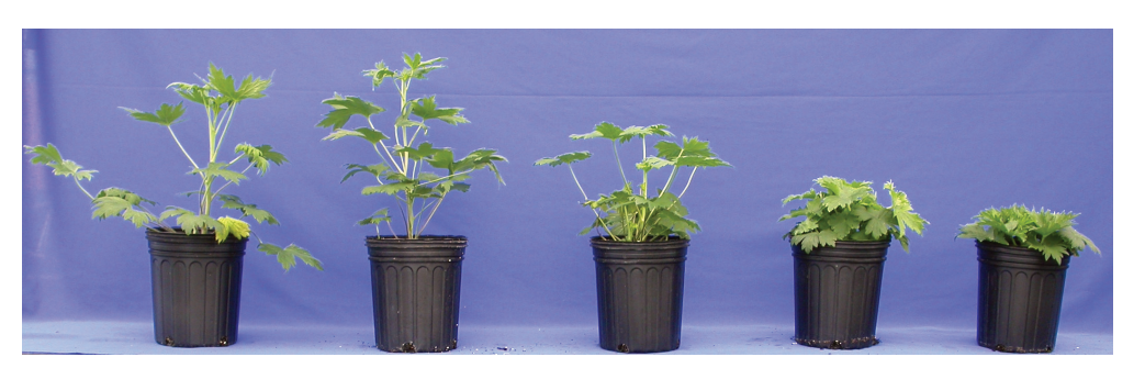
Figure 8. Larkspur ( Delphinium elatum 'Blue Bird') at four weeks after treatment with paclobutrazol, left to right: untreated control, treated with paclobutrazol as a foliar spray at 30 ppm and at 60 ppm, and treated with paclobutrazol as a drench at 1 ppm and at 2 ppm. Overdose symptoms were evident on the plants treated with the 2-ppm drench. The triazole-type PGRs are actively taken up by the roots and are very effective in growth regulation.

To establish rates for plants not listed in the appendix or on the product label, treat a small number of plants with 30 to 100 ppm as a foliar spray or up to 10 ppm as a drench. In many cases, multiple treatments with lower rates have been more effective, with less chance of overstunting than a single application at a higher rate.