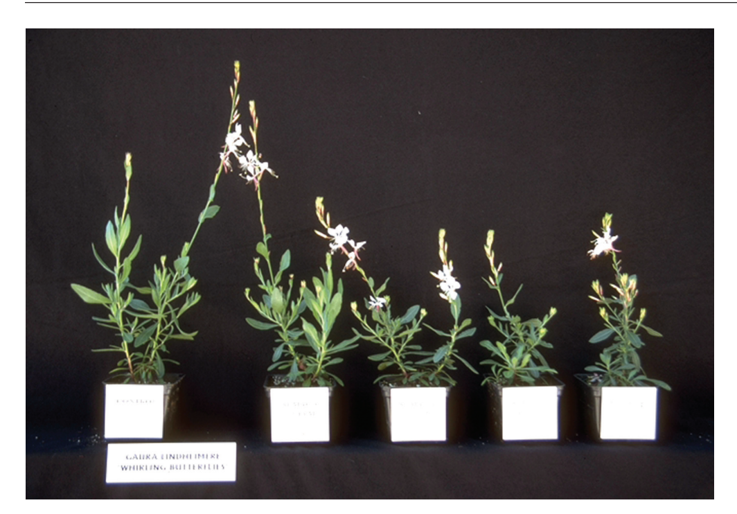
Figure 9. Elongation of flower inflorescence may be more affected by plant growth regulators than elongation of stem tissue is, as seen with white gaura ( Gaura lindheimeri 'Siskiyou Pink') treated with increasing rates of uniconazole, left to right: 0, 15, 30, 45, and 60 ppm. Photo was taken at five weeks after treatment.

Uniconazole also has a broad label for ornamentals, but its use is limited to containerized plants grown in greenhouses, overwintering structures, shadehouses, or lath houses. It is not labeled for outdoor nursery use. Uniconazole also is not labeled for application through any irrigation system. It has been very effective on a large number of perennials, with spray rates in the 15to 45-ppm range in the South and Mid-Atlantic areas. We have done less research on drench rates on perennials. However, we have found them to be very sensitive to uniconazole with good growth control using 0.5- to 2.0-ppm drenches. Because it is very potent, pay special attention to uniform application and proper volumes. Use caution in the higher rates or on more sensitive species because uniconazole effects can be very persistent in plants even after they have been transplanted into the landscape.