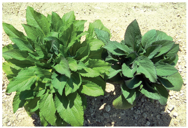
Figure 2. Digitalis 'Foxy' untreated (left) and treated with 15 ppm uniconazole (right). Plant growth regulators "green up" plants by concentrating chlorophyll into smaller leaf cells, improving plant color and appearance.

This is where the art of plant growth regulation is most important. You must learn how your crop grows and when to intervene to obtain the desired results. Remember to note details of crop development in your records of PGR treatments. For example, due to weather conditions, next year you may need to treat at seven days after transplanting instead of at 10 days after transplanting, which you used this year. You must gauge when rapid elongation will likely occur and treat to counter it.