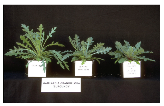
Figure 6. Blanket flower (Gaillardia x grandiflora 'Burgundy') was responsive to daminozide. Left to right: untreated control, two applications (at a two-week interval) of 5,000-ppm daminozide, and one application of a tank mix of 5,000-ppm daminozide and 1,500-ppm chlormequat chloride. Photo was taken at three weeks after treatment. Multiple applications of the tank mix were required for long-term control.

Although the rate of daminozide is usually adjusted to increase or decrease activity, changing the chlormequat chloride rate also affects activity. Shoot height of many of the perennials listed in the appendix was effectively controlled by this tank mix, including blanket flower (Gaillardia grandiflora 'Burgundy') and Russian sage (Perovskia atriplicifolia), along with two of the ornamental grasses, Sorghastrum 'Indian Steel' and Calamagrostis 'Karl Foerster' (figure 6). Single applications of the tank mix are frequently more effective than multiple applications of daminozide alone. In other crops where the tank mix is listed in the appendix as nonresponsive (NR) with one application, the effects may have been too short-term for the research evaluation. Multiple applications of the tank mix may provide control of these species.