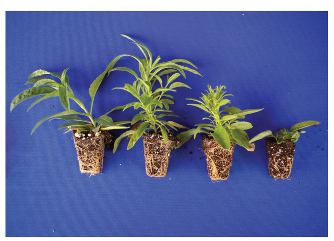
Figure 12. Spike speedwell ( Veronica 'Goodness Grows') treated with dikegulac sodium (Augeo) at, left to right: 0, 400, 800, and 1,600 ppm showed enhanced branching at 400 ppm but excessive growth reduction at higher rates. Photo taken at four weeks after treatment.