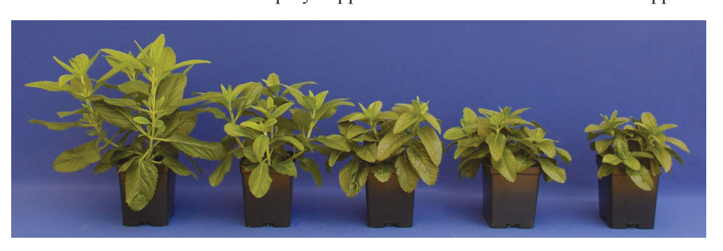
Figure 7. Veronica 'Icicle' treated with drenches of ancymidol, left to right: untreated, 2-, 4-, 6-, and 8-ppm drenches of ancymidol applied as 2 fluid ounces per quart pot. Higher rates caused excessive growth reductions and bronzing of the leaves. Photo was taken at six weeks after treatment.

Flurprimidol (Topflor; REI = 12 hours) is similar in chemistry to ancymidol but much more potent. Its activity is similar to that of the triazoles. Herbaceous perennials have proven very responsive to flurprimidol. With spray applications, Topflor rates are similar to those used with paclobutrazol. However, in soil applications, its activity is more similar to that of uniconazole. It is labeled for use as a spray or drench on containerized ornamental plants grown in nurseries, greenhouses, and shadehouses. Topflor is labeled for chemigation. Test spray rates around 15 to 40 ppm. We have not researched drench applications on perennials but reports on other bedding plants suggest drench rates of about 0.25 to 4 ppm.