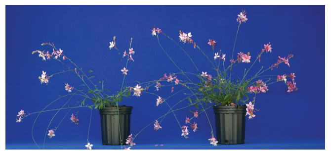
Figure 11. Benzyladenine (Configure) improved branching and flowering of white gaura ( Gaura lindheimeri 'Siskiyou Pink'): untreated (left) and 600 ppm applied at two weeks after transplant (right). Photo taken at four weeks after final treatment.

Initial work on herbaceous perennials focused on Hosta and Echinacea , both of which are very responsive to BA. In our trials, multiple cultivars of Echinacea have developed two to four times the number of basal branches versus untreated plants when treated about two weeks after potting. Other researchers have reported similar results with a number of other Echinacea cultivars. Further screening trials with other herbaceous perennials have identified a large number of crops that showed increased basal or lateral branching in response to a 600-ppm BA spray (see appendix) (figure 11).