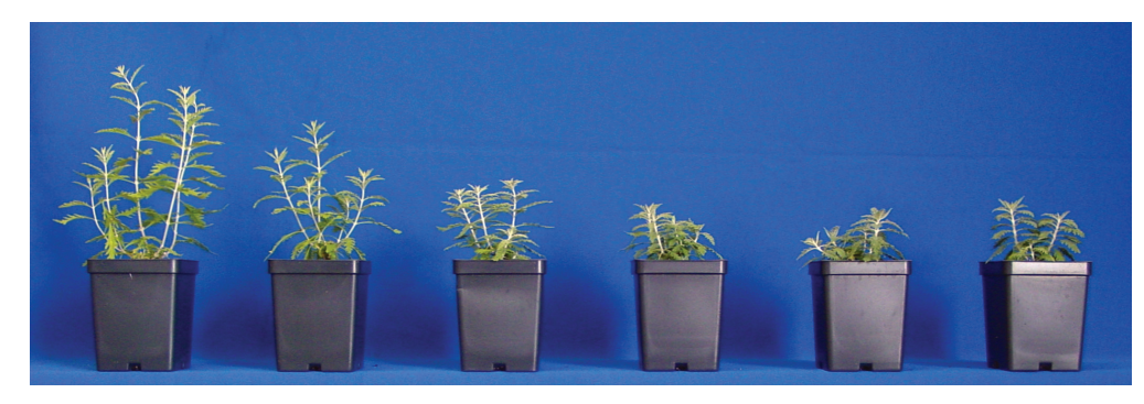
Figure 5. Russian sage ( Perovskia atriplicifolia ) treated with paclobutrazol liner dips (10 minutes in solution) at the time of planting. Top photo shows good baseline control of plant height at five weeks after treatment with, left to right: 0-, 2-, 4-, 6-, 8-, and 10-ppm paclobutrazol. Bottom photo shows the same plants at eight weeks after treatment; plants treated with 2-ppm paclobutrazol were comparable to controls, while those treated with 6 ppm were still well-controlled.

To maximize uptake, the chemical must remain in contact with the leaf long enough to be absorbed. This time varies for the different PGRs, but generally, foliar uptake is enhanced with slower drying conditions, which in turn increases the effectiveness of the treatment. Plants treated with daminozide or ethephon