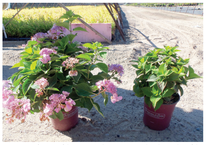
Figure 4. Uniformity of the spray application is critical to the quality of the crop. Both of these 'Forever and Ever' hydrangeas were treated with 10 ppm of uniconazole during the same spray application.

Spray droplet size also affects response, with smaller droplet sizes providing better coverage — but only up to a point. Mist- or fog-type applicators do NOT provide adequate volume for coverage of plant stems and the medium and, therefore, have not been effective when used with compounds like paclobutrazol and uniconazole. PGR applicators should be trained to uniformly apply a given amount of clear water in the greenhouse before they make PGR applications. Uniformity of the application is critical to the uniformity of the crop response (figure 4).