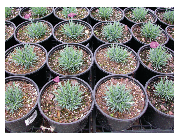
Figure 10. Young dianthus plants treated with ethephon to enhance branching and plant quality.

Ethephon should be applied to actively growing plants prior to flower development (figure 10). If flowers are present at the time of application, they are likely to abort. Ethephon may delay flowering by about one to two weeks, particularly if applied close to the time of flower initiation. Ethephon should not be applied to plants that are heat- or drought-stressed.