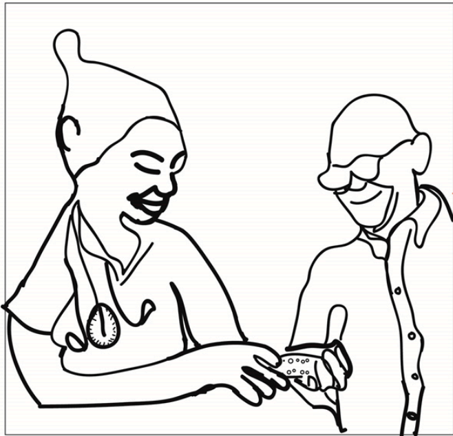
Figure 2: A Village health worker showing a member of the community how to take some tablets. Image drawn by Titilola T. Obilade.

current EVD outbreak. In the 21st Century, the global community has never experienced a prolonged rapidly killing infectious disease outbreak of such exponential proportions. The control of EVD must involve aggressive contact tracing and close monitoring of contacts, isolation of infected persons, effective infection control and intensive supportive care. One of the hallmarks of control is quick identification of cases. The heavy loss of health care workers either through infection or through mob attacks has left a void in the basic health care system which would take years to rebuild. Therefore, to control the EVD outbreak, the principles of primary health care must be applied. Village health workers should be considered for a potential role in the control of EVD in the current outbreak.