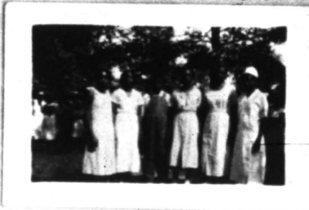
Home and Work outfit in the Dress Contest