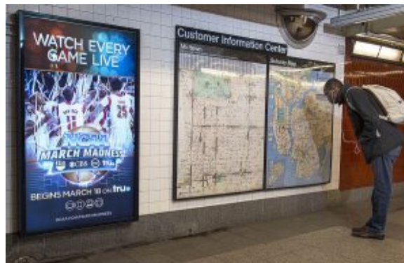
Figure 14.8: A digital advertising screen in the New York subway

Advertising is paid, non-personal communication designed to create an awareness of a product or company. Ads are everywhere—in print media (such as newspapers, magazines, the Yellow Pages), on billboards, in broadcast media (radio and TV), and on the Internet. It’s hard to escape the constant barrage of advertising messages; it’s estimated that the average consumer is confronted by about 5,000 ad messages each day (compared with about 500 ads a day in the 1970s). 19 For this very reason, ironically, ads aren’t as effective as they used to be. Because we’ve learned to tune them out, companies now have to come up with innovative ways to get through to potential customers. A New York Times article 20 claims that “anywhere the eye can see, it’s likely to see an ad.” Subway turnstiles are plastered with ads for GEICO auto insurance, Chinese food containers are decorated with ads for Continental Airways, and parking meters display ads for Campbell’s Soup 21 Advertising is still the most prevalent form of promotion.