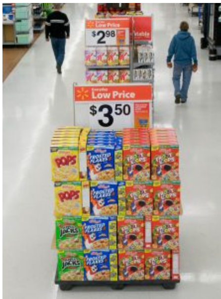
Figure 14.10: Sales promotion at Wal-Mart

It's likely that at some point, you have purchased an item with a coupon or because it was advertised as a buy-one-get-one special. If so, you have responded to a sales promotion – one of the many ways that sellers provide incentives for customers to buy. Sales promotion activities include not only those mentioned above but also other forms of discounting, sampling, trade shows, in-store displays, and even sweepstakes. Some promotional activities are targeted directly to consumers and are designed to motivate them to purchase now. You've probably heard advertisers make statements like "limited time only" or "while supplies last". If so, you've encountered a sales promotion directed at consumers. Other forms of sales promotion are directed at dealers and intermediaries. Trade shows are one example of a dealer-focused promotion. Mammoth centers such as McCormick Place in Chicago host enormous events in which manufacturers can display their new products to retailers and other interested parties. At food shows, for example, potential buyers can sample products that manufacturers hope to launch to the market. Feedback from prospective buyers can even result in changes to new product formulations or decisions not to launch.