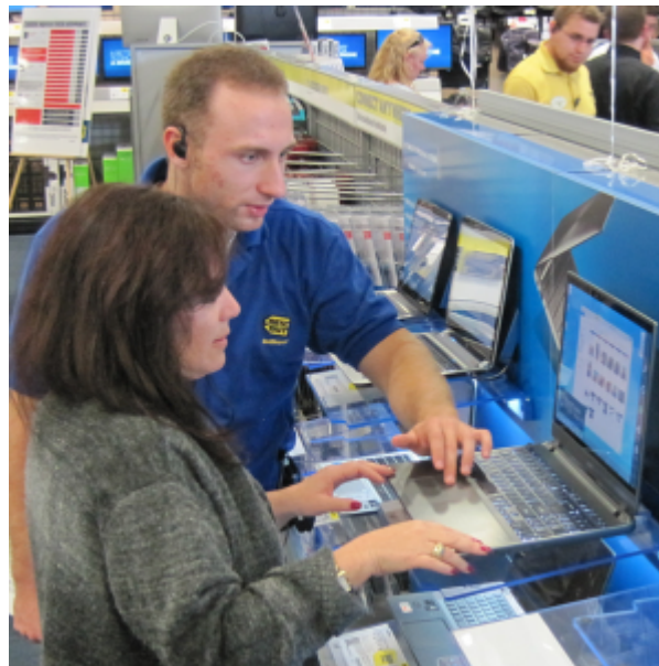
Figure 14.9: Personal selling at Best Buy

Personal selling refers to one-on-one communication with customers or potential customers. This type of interaction is necessary in selling large-ticket items, such as homes, and it's also effective in situations in which personal attention helps to close a sale, such as sales of cars and insurance policies.