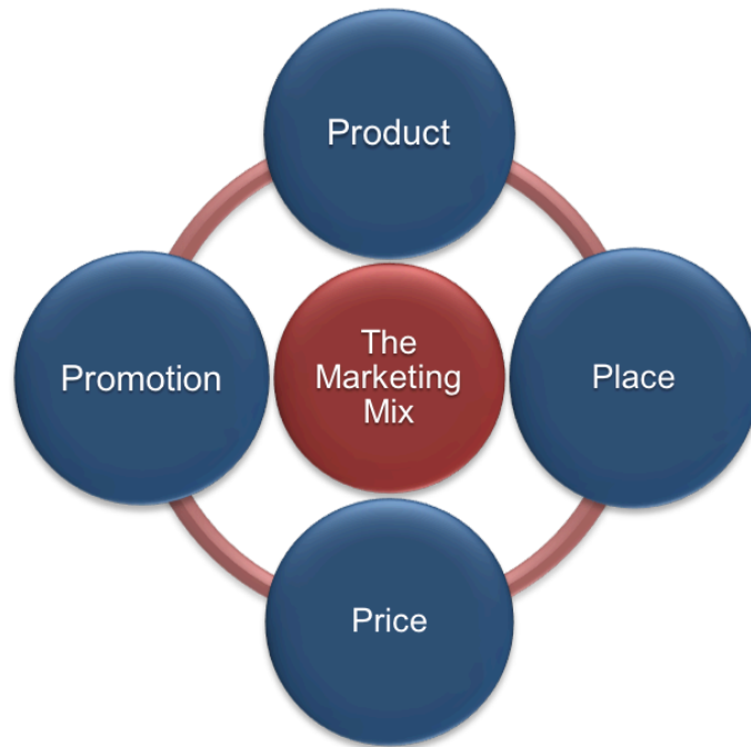
Figure 14.4: The Marketing Mix