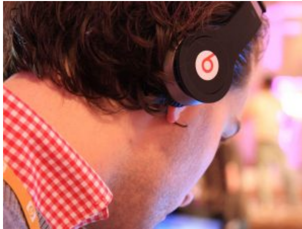
Figure 14.11: Beats headphones by Dr. Dre

Consumer perception of a company is often important to a company's success. Many companies, therefore, manage their public relations in an effort to garner favorable publicity for themselves and their products. When the company does something noteworthy, such as sponsoring a fund-raising event, the public relations department may issue a press release to promote the event. When the company does something negative, such as selling a prescription drug that has unexpected side effects, the public relations department will work to control the damage to the company. Each year the Hay Group and Korn Ferry survey more than a thousand company top executives, directors, and industry leaders in twenty countries to identify companies that have exhibited exceptional integrity or commitment to corporate social responsibility. The rankings are published annually as Fortune magazine's "World's Most Admired Companies.®" 26 Topping the list in 2016 are Apple, Alphabet (Google), Amazon, Berkshire Hathaway, and Walt Disney. 27