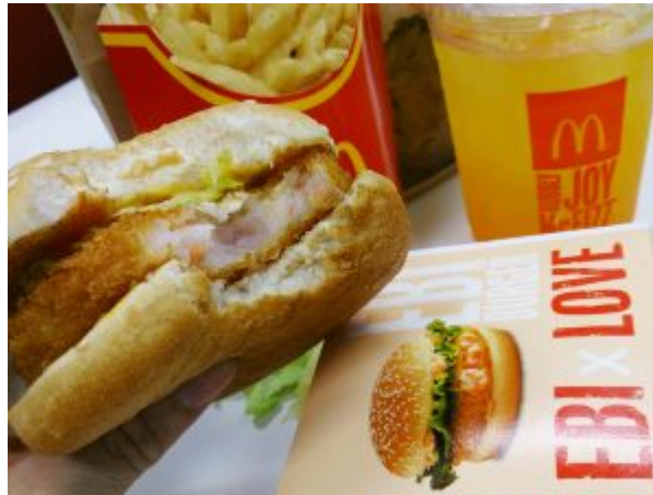
Figure 14.3: A McDonald's Ebi (prawn) burger meal in Singapore

Likewise, differences between urban and suburban life can influence product selection. For example, it's a hassle to parallel park on crowded city streets. Thus, Toyota engineers have developed a product especially for city dwellers. The Japanese version of the Prius, Toyota's hybrid gas-electric car, can automatically parallel park itself. Using computer software and a rear-mounted camera, the parking system measures the spot, turns the steering wheel, and swings the car into the space (making the driver—who just sits there—look like a master of parking skills). 11 After its success in the Japanese market, the self-parking feature was brought to the United States.