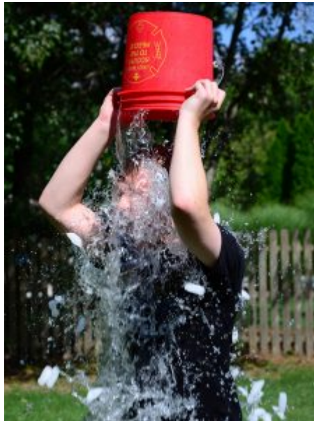
Figure 14.13: The ALS Ice Bucket Challenge in action