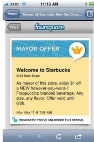
Figure 14.15: Starbucks and Foursquare promotion