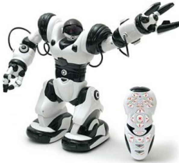
Figure 14.12: Robosapien

Meanwhile, Robosapien was also getting lots of free publicity. Stories appeared in newspapers and magazines around the world, including the New York Times, the Times of London, Time magazine, and National Parenting magazine. Commentators on The Today Show, The Early Show, CNN, ABC News, and FOX News all covered it. The product received numerous awards, and experts predicted that it would be a hot item for the holidays.