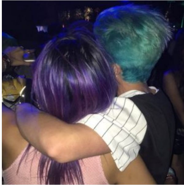
Figure 14.14: Two friends who disagree on which Mountain Dew Flavor to vote for