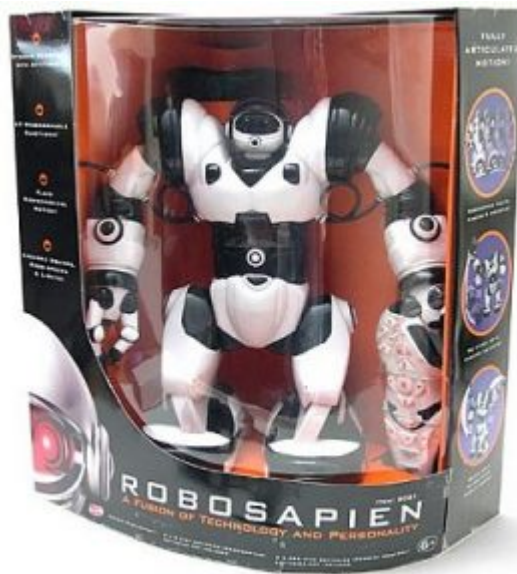
Figure 14.6: Robosapien in its package

How has Wow Wee handled the packaging and labeling of Robosapien? The robot is fourteen inches tall, and is also fairly heavy (about seven pounds), and because it's made out of plastic and has movable parts, it's breakable. The easiest, and least expensive, way of packaging it would be to put it in a square box of heavy cardboard and pad it with Styrofoam. This arrangement would not only protect the product from damage during shipping but also make the package easy to store. However, it would also eliminate any customer contact with the product inside the box (such as seeing what it looks like). Wow Wee, therefore, packages Robosapien in a container that is curved to his shape and has a clear plastic front that allows people to see the whole robot. Why did Wow Wee go to this much trouble and expense? Like so many makers of so many products, it has to market the product while it's still in the box.