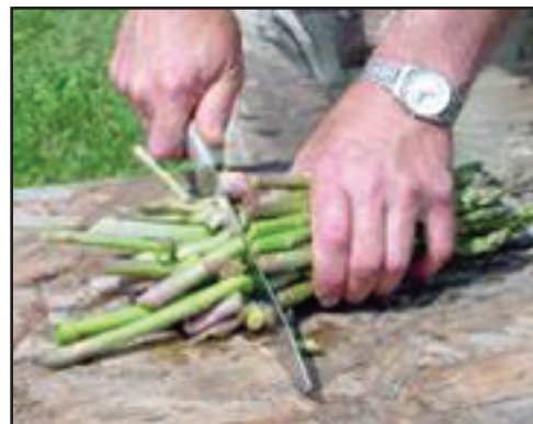
Figure 6: Trimming spears in bundle to equal length.