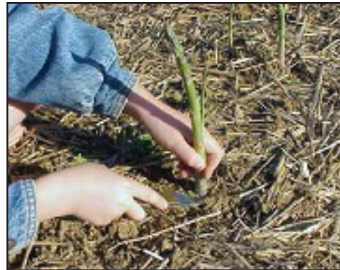
Figure 5: Harvesting asparagus at or below ground level with sharp knife.

able spears. Non-marketable or missed spears should not be allowed to grow out while the harvest is in progress (i.e. keep the field “clean-cut”). Spears should be harvested when they are eight to 10 inches long (Figure 5), and cut just below the surface, or snapped at ground level. With snapping, the fibrous white base is left. Both methods are acceptable. All spears should be trimmed to a uniform length (Figure 6) and washed clean of soil particles prior to sale. For retail sales, the spears should be bundled in one-pound bunches. For wholesale markets, spears are packed upright in wooden crates designed for asparagus. Spears should always be stored in an upright position or the tips will bend and turn upward. For direct marketing, spears can be set in a tray of shallow water, with the butt-end immersed. Fresh asparagus should be marketed as soon as possible, but can be held for about seven to 10 days in a cooler at 33° to 36°F with the bases kept moist and the humidity high. Asparagus quickly loses quality and become fibrous at temperatures above 40°F. Do not allow ice to come into direct contact with spears as this may cause chilling injury.