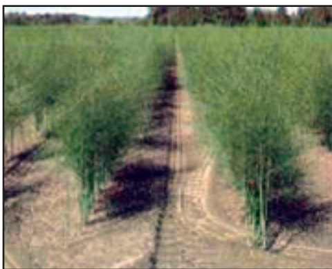
Figure 9. Weed free asparagus planting utilizing tillage and herbicides.

Control weeds by mulching, hoeing, or using registered herbicides on established beds. Given the range of herbicide materials available, a weed-free planting is possible (Figure 9). Both pre- and postemergence herbicides are available for asparagus, and pre-emergence materials can be applied at several critical times (early spring, after the last harvest, and late fall) for season-long control. Weeds can be partially managed by light tillage (one to two inches deep) when spears are not present, such as the very early spring before spears emerge, just after the last clean-cut harvest, or in the late fall when the tops die down. These tillage windows coincide with, and can be used to incorporate pre-emergence herbicides and supplementary fertilizer. Special care should be taken to adjust tillage equipment depth to avoid damage to crowns. In older plantings, determining the crown location/depth should be done carefully as crowns tend to “rise” in position over time. Also for direct-seeded fields, crowns will be