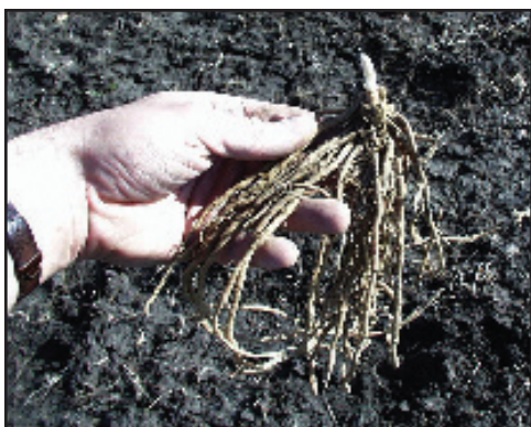
Figure 2: Asparagus crown with new shoot.

winter, crowns should be dug, size sorted, and kept in cold storage (35° to 40°F) until spring. Asparagus can also be established from greenhouse-grown seedling transplants in peat pots or plastic cell trays, but time to first harvest is delayed by one season as the seedlings are not as vigorous as one-year-old crowns (Figure 3). Seeds will germinate and emerge in 10 to 14 days at 70° to 75°F. Greenhouse temperatures should range from 65°F at night to 85°F during the day. Seedlings will be ready for transplanting in eight to 12 weeks when they are six to 10 inches tall. Like direct field seeding, growing greenhouse seedlings or raising your own crowns in seed beds may not be as economical or practical as buying nursery crowns for plantings of an acre or less.