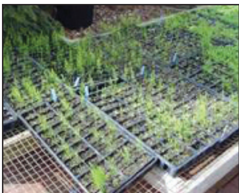
Figure 3: Asparagus seedlings grown in plastic cell trays.

winter, crowns should be dug, size sorted, and kept in cold storage (35° to 40°F) until spring. Asparagus can also be established from greenhouse-grown seedling transplants in peat pots or plastic cell trays, but time to first harvest is delayed by one season as the seedlings are not as vigorous as one-year-old crowns (Figure 3). Seeds will germinate and emerge in 10 to 14 days at 70° to 75°F. Greenhouse temperatures should range from 65°F at night to 85°F during the day. Seedlings will be ready for transplanting in eight to 12 weeks when they are six to 10 inches tall. Like direct field seeding, growing greenhouse seedlings or raising your own crowns in seed beds may not be as economical or practical as buying nursery crowns for plantings of an acre or less.