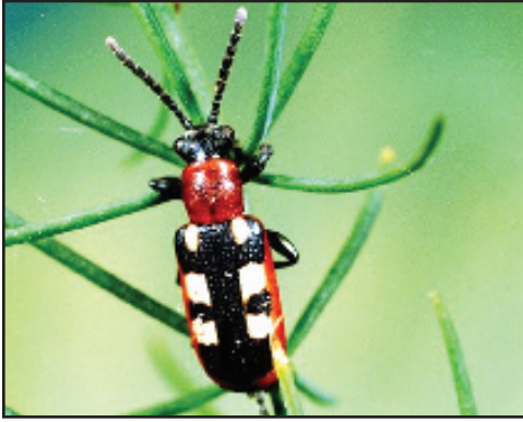
Figure 10a: Common asparagus beetle adult.