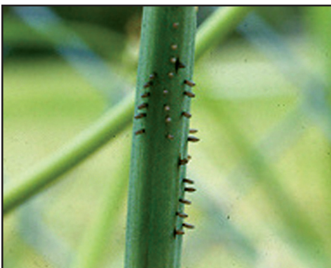
Figure 10c: Eggs of common asparagus beetle on asparagus stem.

time, the planting becomes less productive and eventually not economical to manage. Early signs of crown rot should be monitored and aggressively addressed with application of registered fungicide drenches. In addition, it has been noted that nitrogen fertilizers may enhance this disease, and total rates should be reduced in subsequent years. Most new cultivars are noted for their asparagus rust resistance. However, under conditions of high rainfall and humidity, the disease should be monitored and controlled, particularly toward the end of the summer when ferns are building the crowns for next year's crop. Ferns with rust will gradually turn brown as the disease spreads. Pustules containing rust spores will be visible on the stems. A preventative versus a curative disease program is recommended using registered fungicide materials.