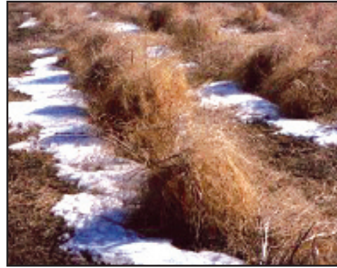
Figure 7. Winter-killed asparagus ferns.

are a problem or if the grower is interested in delaying harvest onset for other reasons (such as timing the crop to overlap better with strawberries). If there has been difficulty with asparagus beetle or rust during the growing season, it is best to remove the ferns. Mowing followed by light tillage over the rows can be done to destroy overwintering habitat for these insects and reduce inoculum of asparagus rust (see the Site Tillage section). Light tillage will also help to incorporate chopped fern stems, and speed their breakdown.