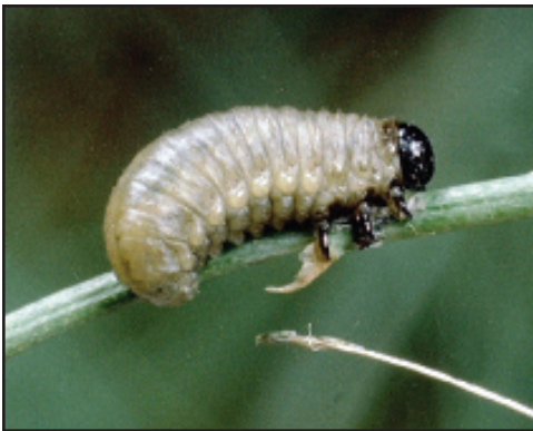
Figure 10b: Common asparagus beetle larva feeding on fern growth.