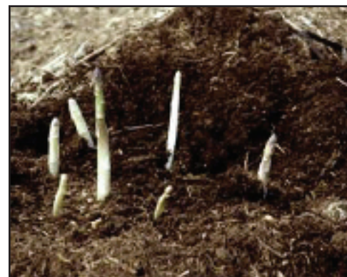
Figure 8. White asparagus culture using a soil ridge. (Note green tips resulting from contact with sunlight.)

White or blanched asparagus is asparagus that has been grown in the absence of light. It is not a special cultivar, but rather a method of growing that uses various techniques to exclude light from emerging spears. White asparagus production is highly specialized and intensive, but results in a crop that usually receives a premium price, often two to three times that received for green asparagus (Figure 8). It is favored by high-end restaurant chefs, and has a distinct flavor and textural difference. Various methods have been employed