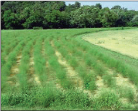
Figure 4: Healthy asparagus field and fern growth near the James River, Virginia.

Each spring, spears (shoots) will emerge from buds formed on the crown the previous season. The emerging spears quickly lengthen, and begin to branch out, forming a canopy of fine-textured “fern” growth (Figure 4). Managing the fern growth is critical to success with asparagus. During the growing season, the ferns are actively building the crowns and buds for the next harvest season. Disease and insects can defoliate ferns by mid-season, and growers should be vigilant to maintain green and actively growing ferns until they are killed by fall frost.