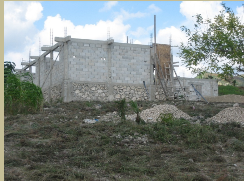
School building under construction for Bon Berger to open March 2009.