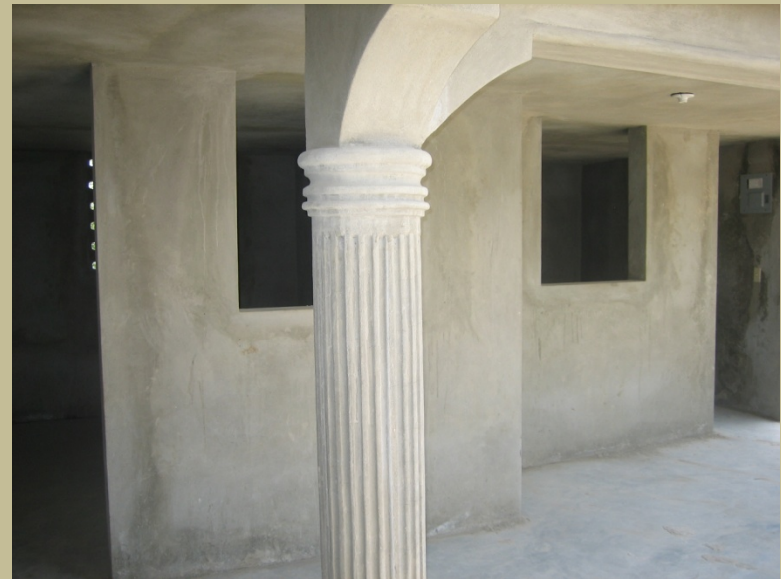
New school construction at Chapoteau, finished July 2008.