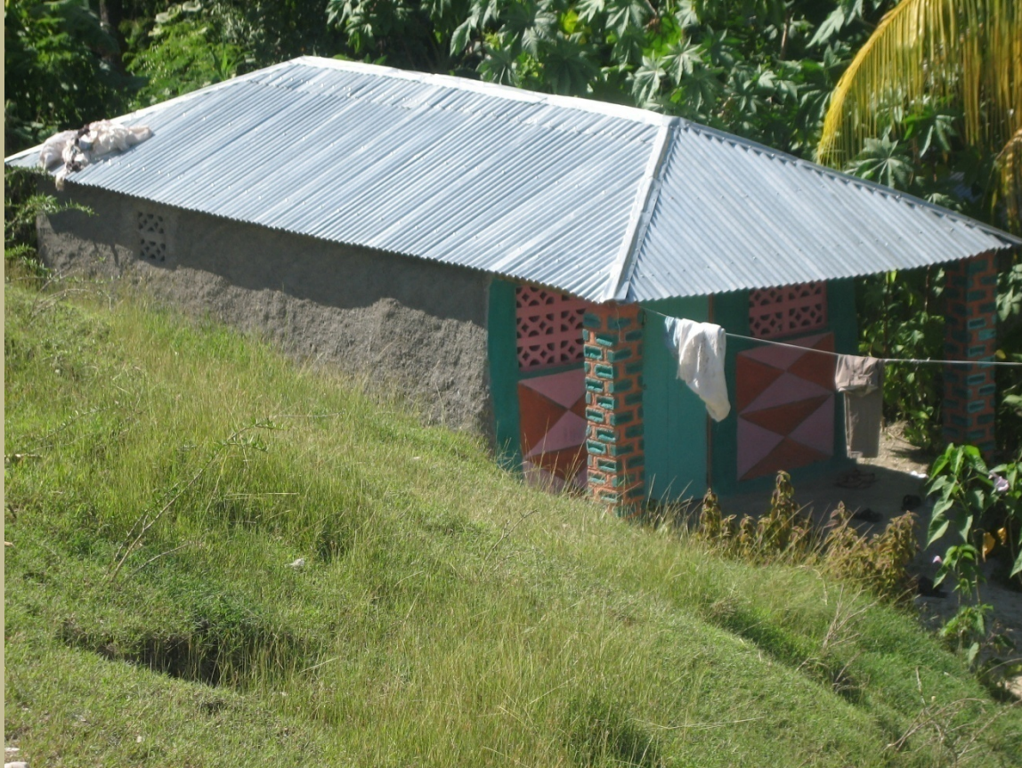
House that ZL built for one of our patients.