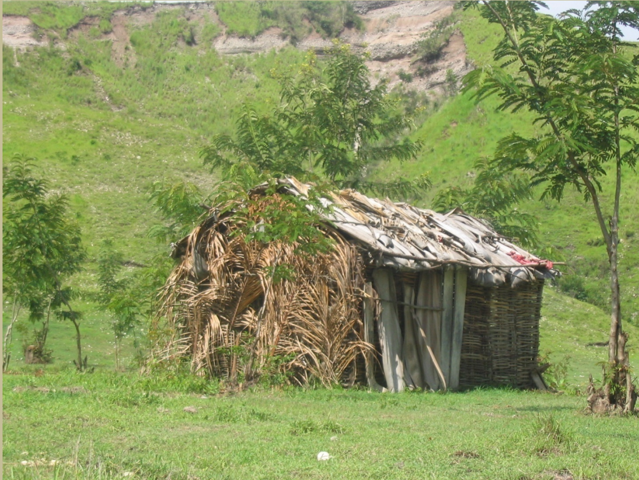
Typical home in the Central Plateau