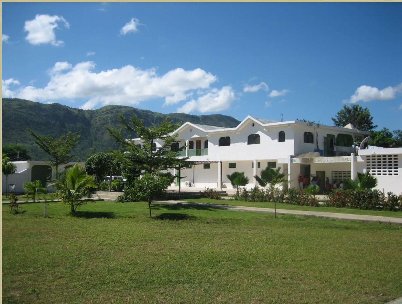
Public hospital PIH runs at Cerca la Source