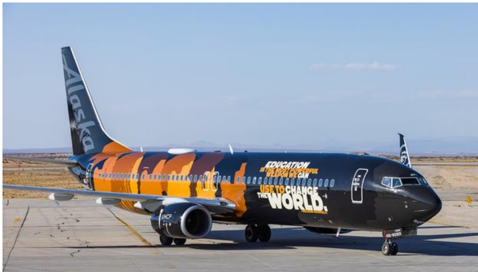
Alaska Airlines' 'Our Commitment' aircraft.

Alaska Airlines has unveiled a new aircraft to showcase its commitment to increasing racial diversity, cultivating an inclusive culture and working alongside community-based organizations to promote education and career development.