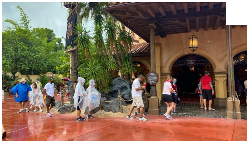
Pirates of the Caribbean Distanced Queue at Walt Disney World's Magic Kingdom