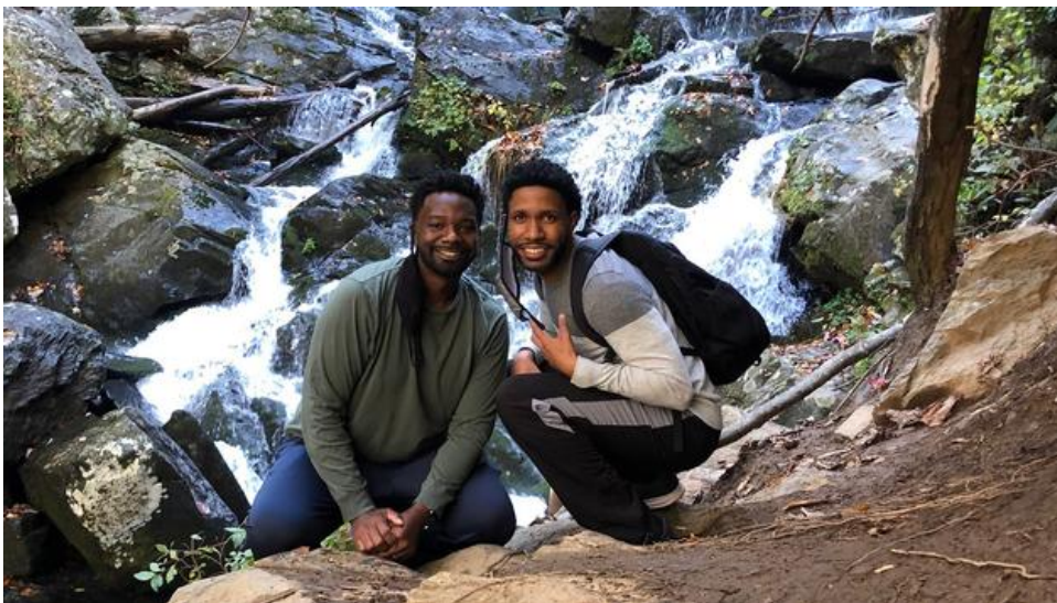
PHOTO: The hike to Catawba Falls is one of the Asheville area's most scenic.

My partner and I have always been equally attracted to the charms of urban life and the call of nature. Subsequently, when we plan a vacation, we're equally likely to choose a big city like San Francisco or Miami or a national park in Montana or Utah. So what a discovery we made with a recent visit to Asheville, N.C.!