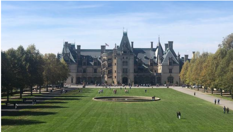
PHOTO: The Biltmore Estate, located in Asheville, N.C., is a must-see sight in this part of the country.

Biltmore offers more than the house, though. The 8,000-acre grounds are gorgeous, with formal and informal gardens to wander through, as well as a conservatory. You can get as active as you wish, with horseback riding, hiking, fly fishing and more. And the nearby Antler Hill Village, winery and village hotel allow visitors to shop, imbibe, and overnight at the estate.