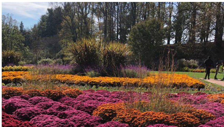
PHOTO: The Biltmore Estate's gardens offer beauty in every season. (photo by Paul Heney)

Explore Asheville has a fantastic Hike Finder page that is simple to use. You can filter by difficulty, distance from downtown or length, as well as by scenery—are you looking for waterfalls, wildflowers, scenic views? Plus, year-end visitors enjoy a greatly extended fall colors season here, due to the wide variety of elevations from the top of the mountains to the downtown area set in a valley. Peak colors start at the highest elevations and gradually work their way down over the course of many weeks.