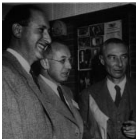
Robert Marshak, Robert Bacher, and Robert Oppenheimer at the Sixth Rochester Conference on High Energy Nuclear Physics, 1955.

This son of immigrants, an affable, brilliant workaholic who counted world-renowned scientists as intimate friends,