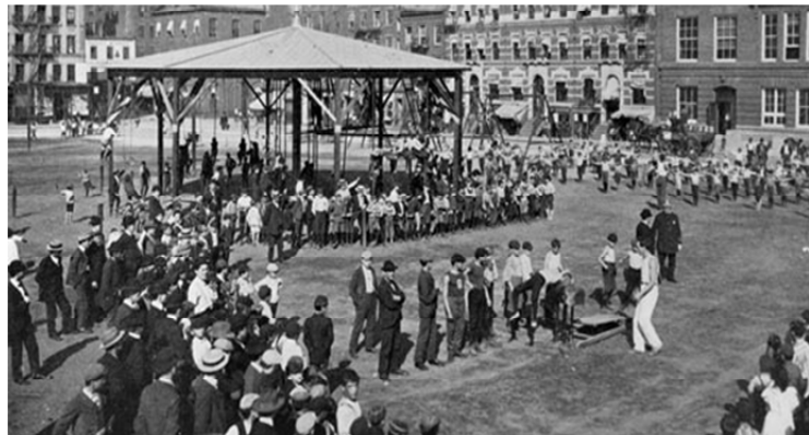
Figure 4.1: Large Pavilions surrounded by open space (often concrete, asphalt, grass or dirt) were common in early playgrounds. This playground is located in New York City. 12 [Public Domain]

Many urban children only experienced outdoor play in streets, alleyways, and vacant lots. 9 Public schools in major urban areas during the late 19th century were some of the first playscapes designed specifically for children in the United States. 10 Before public parks began to include playgrounds, most “play areas were built by private philanthropic organizations and the public education system.” 11