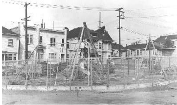
Figure 4.4: The first West Oakland municipal playground used as a community center opened in 1910. This shows the typical metal and wooden frames used in playground equipment. 22 [Public Domain]

Playgrounds of the late 19th and early 20th century showed society’s desire to provide children with social environments in which to play and develop moral behaviors. 23 These playscapes provided only the most basic play equipment and encouraged large groups of children to play in vast open spaces. Concern over types of play, exposure to nature experiences, and physical development were not expressed due to the primary concern for social improvements and improvement of quality of life for working children. The objective of traditional playground design was social improvements. After World War I when American playground development began to include innovative ideas of creative play such as building materials for children to construct their own playscapes.