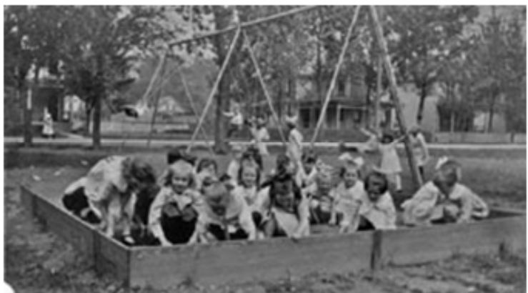
Figure 4.3: The Grandview Elementary School Playground in Oakland, California in 1918 shows early metal pipe swings with a wooden encased sandbox. This is a typical school playground in the early 1900’s. 21 [Public Domain]

Around 1920 playground equipment began to include “Jungle Jims” 17 used for climbing and constructed from metal pipes. 18 This innovation soon led to the development of steel climbers, swings, and pre-developed play structures. 19 In addition, sand boxes and fences were a common addition to playgrounds of the 1920s. 20