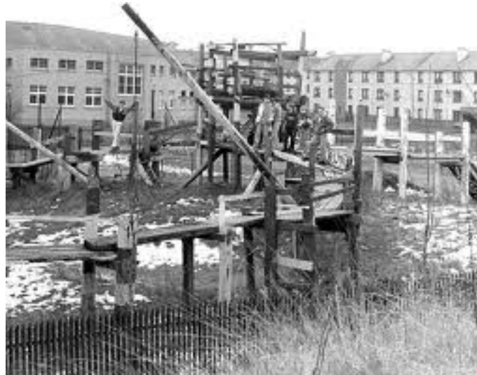
Figure 4.5: Junk Playground of the mid 1900s in London, England. 29 [Public Domain]

found materials to construct their own playscapes, but they often addressed parental safety concerns by providing adult supervision and restricted access to construction materials and surfaces. It was not until the 1960s that the U.S. parents and children became interested in implementing adventure playgrounds.