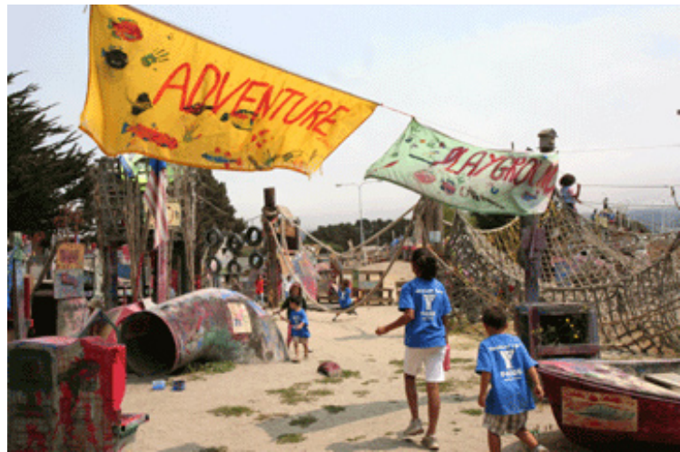
Figure 4.6: Adventure Playground was opened in 1979 in the City of Berkeley, California as part of the Marina Experience program. 34 [Public Domain]

playgrounds have the ability to work together to cooperatively solve problems as well as explore the physical demands of building their own playscape. In terms of nature experiences, adventure playgrounds also offer children exposure to natural elements which traditional playgrounds did not incorporate.